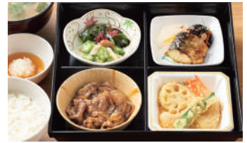
Yayoi Gozen (Tempura)