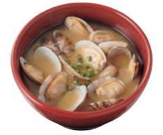
Clam Miso Soup (à la carte) ¥ 290