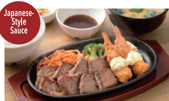
Black Angus Cut Steak and Deep-Fried Prawn Teishoku