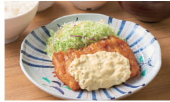
Fried Chicken with Tartar Sauce Teishoku