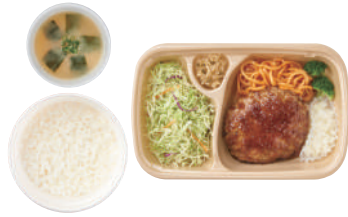
Japanese-Style Hamburger Steak with Grated Daikon With rice and miso soup ¥ 860