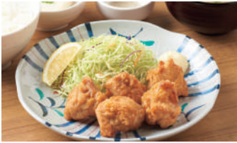
Deep-Fried Chicken Teishoku