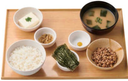
Natto Breakfast Teishoku