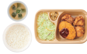
Deep-Fried Chicken & Potato Croquette With rice and miso soup ¥ 790