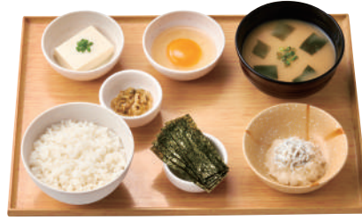
Whitebait and Grated Daikon Breakfast Teishoku

(Breakfast menu options are served from 5:00-11:00 a.m. at 24-hour restaurants. For other restaurants, please inquire at the restaurant.)