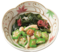
Steamed Chicken and Seaweed with Ponzu Sauce Side Dish ¥ 120