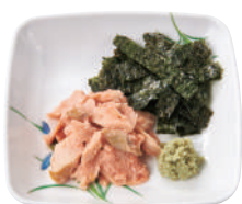
Flaked Salmon Side Dish (for Rice in Stock Broth) ¥ 150