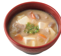
Pork miso soup (à la carte) ¥ 290