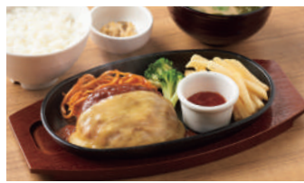
Four-Cheese Hamburger Steak Teishoku