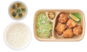
Deep-Fried Chicken With rice and miso soup ¥ 790