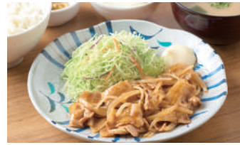
Ginger Pork Teishoku