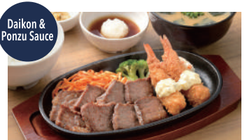
Black Angus Cut Steak and Deep-Fried Prawn Teishoku