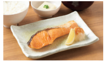
Salt-Grilled Silver Salmon Teishoku