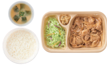
Ginger Pork With rice and miso soup ¥ 730