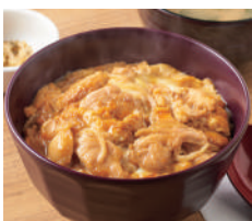
Awao Chicken and Egg Rice Bowl (with Miso Soup)