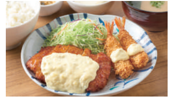
Fried Chicken with Tartar Sauce & Deep-Fried Prawns Teishoku