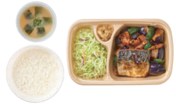
Stir-Fried Pork and Eggplant in Miso Sauce with Grilled Fish With rice and miso soup ¥ 1,020