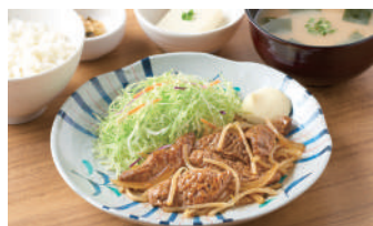
Ginger Soy Meat Teishoku