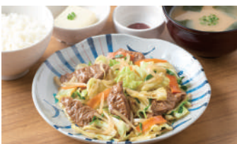
Stir-Fried Soy Meat and Vegetables Teishoku

(Free refills on rice with set meals (excluding rice with pearl barley).)