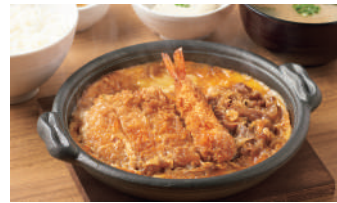
Mixed Fried Foods Topped with Egg Teishoku