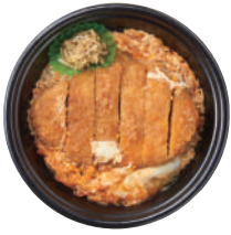
Pork Cutlet and Egg Rice Bowl ¥ 670