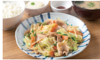
Stir-Fried Pork and Vegetables Teishoku