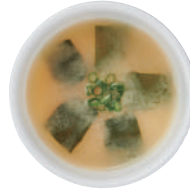
Miso Soup ¥ 100