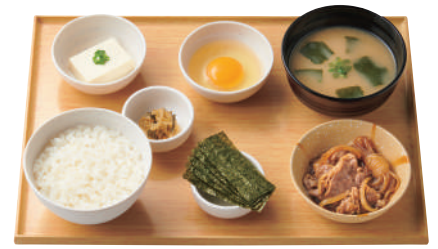
Mini Beef Sukiyaki Breakfast

(Breakfast menu options are served from 5:00-11:00 a.m. at 24-hour restaurants. For other restaurants, please inquire at the restaurant.)