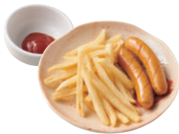
French Fries and Wieners ¥ 250