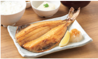
Grilled Atka Mackerel Teishoku