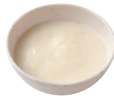
Grated Yam ¥ 170