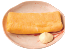
Japanese Omelette ¥ 220