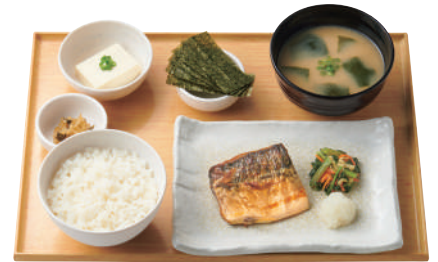
Salt-Grilled Mackerel Breakfast Teishoku

(Breakfast menu options are served from 5:00-11:00 a.m. at 24-hour restaurants. For other restaurants, please inquire at the restaurant.)