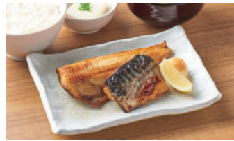
Grilled Atka Mackerel and Salt-Grilled Mackerel Teishoku