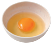
Raw Egg ¥ 60