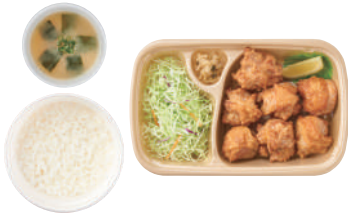
Large Serving Deep-Fried Chicken With rice and miso soup ¥ 960