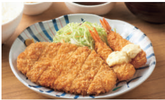
Pork Cutlet and Deep-Fried Prawns Teishoku