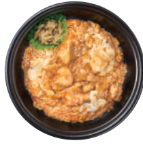
Awao Chicken and Egg Rice Bowl ¥ 660