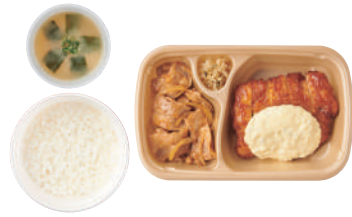
Fried Chicken with Tartar Sauce and Ginger Pork With rice and miso soup ¥ 1,150