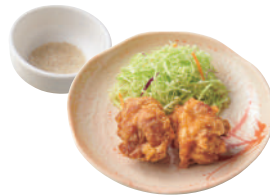
Mini Deep-Fried Chicken ¥ 240