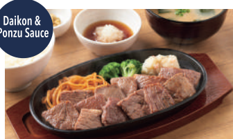
Large Serving Black Angus Cut Steak Teishoku