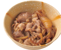
Beef Sukiyaki Side Dish ¥ 280