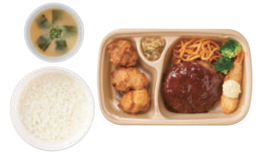
Hamburger Steak, Deep-Fried Prawn and Deep-Fried Chicken With rice and miso soup ¥ 1,150