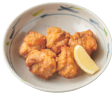
Deep-Fried Chicken (5 pcs.) ¥ 520