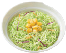
Vegetable Salad ¥ 90