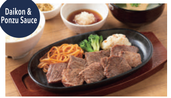
Black Angus Cut Steak Teishoku