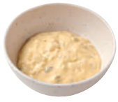
Tartar Sauce (à la carte) ¥ 50