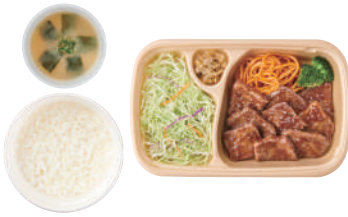
Black Angus Cut Steak With rice and miso soup ¥ 1,340