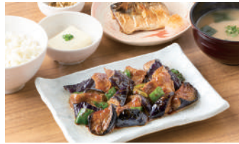
Stir-Fried Pork and Eggplant in Miso Sauce with Grilled Fish Teishoku