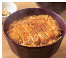
Pork Cutlet and Egg Rice Bowl (with Miso Soup)