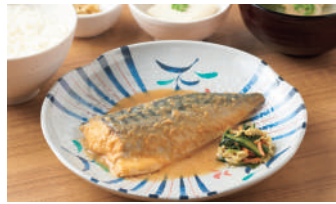
Mackerel Simmered in Miso Teishoku