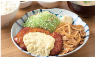
Fried Chicken with Tartar Sauce and Ginger Pork Teishoku