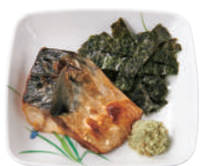
Mini Mackerel Side Dish (for Rice in Stock Broth) ¥ 150