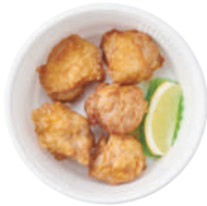
Deep-Fried Chicken (5 pcs.) ¥ 520