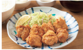
Large Serving Deep-Fried Chicken Teishoku