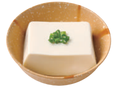
Chilled Tofu ¥ 100