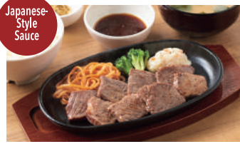
Black Angus Cut Steak Teishoku