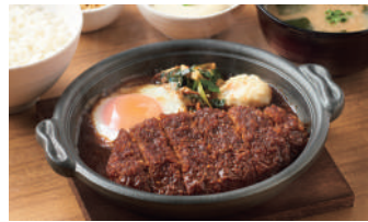
Pork Cutlet Simmered in Miso Sauce Teishoku