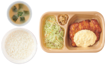
Fried Chicken with Tartar Sauce With rice and miso soup ¥ 1,150