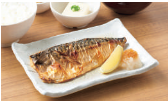
Salt-Grilled Mackerel Teishoku

(Free refills on rice with set meals (excluding rice with pearl barley).)