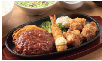
Hamburger Steak, Deep-Fried Prawn and Deep-Fried Chicken Teishoku