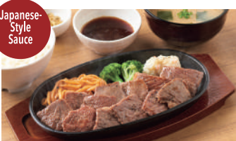
Large Serving Black Angus Cut Steak Teishoku