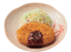
Potato Croquette (à la carte) ¥ 150