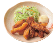
Deep-Fried Squid ¥ 220