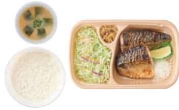
Salt-Grilled Mackerel With rice and miso soup ¥ 770