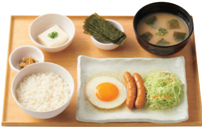
Fried Egg Breakfast Teishoku

(Breakfast menu options are served from 5:00-11:00 a.m. at 24-hour restaurants. For other restaurants, please inquire at the restaurant.)