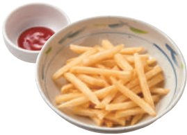
French Fries ¥ 220