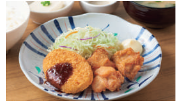
Deep-Fried Chicken & Potato Croquette Teishoku