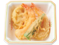
Tempura Side Dish ¥ 290