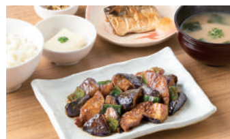
Stir-Fried Soy Meat and Eggplant in Miso Sauce & Grilled Fish Teishoku