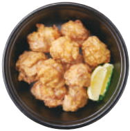
Deep-Fried Chicken (10 pcs.) ¥ 910