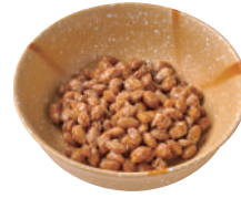
Natto ¥ 100