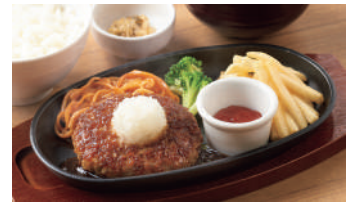
Japanese-Style Hamburger Steak with Grated Daikon Teishoku