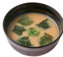
Miso Soup (à la carte) ¥ 100