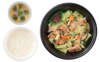
Stir-Fried Pork and Vegetables With rice and miso soup ¥ 820