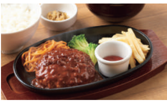
Demi-Glace Hamburger Steak Teishoku