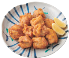
Deep-Fried Chicken (10 pcs.) ¥ 910