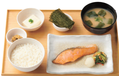
Salt-Grilled Salmon Breakfast Teishoku

(Breakfast menu options are served from 5:00-11:00 a.m. at 24-hour restaurants. For other restaurants, please inquire at the restaurant.)