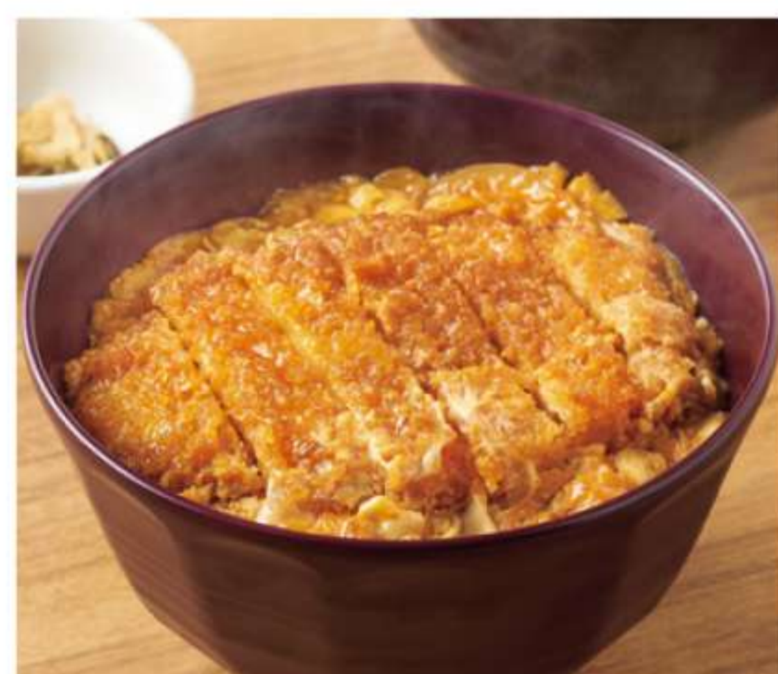
Pork Cutlet and Egg Rice Bowl (with Miso Soup)