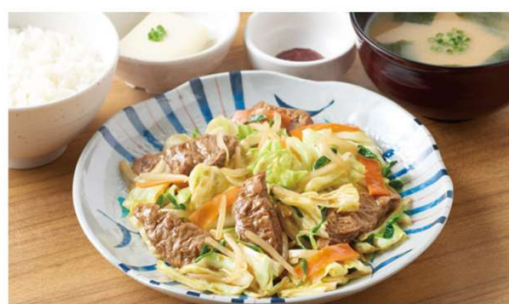
Stir-Fried Soy Meat and Vegetables Teishoku

(Free refills on rice with set meals (excluding rice with pearl barley).)