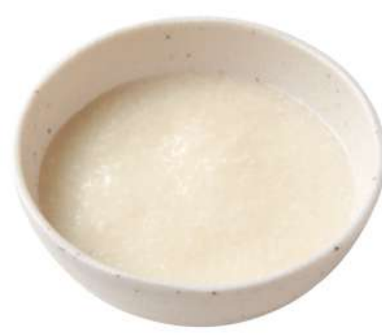
Grated Yam ¥ 170