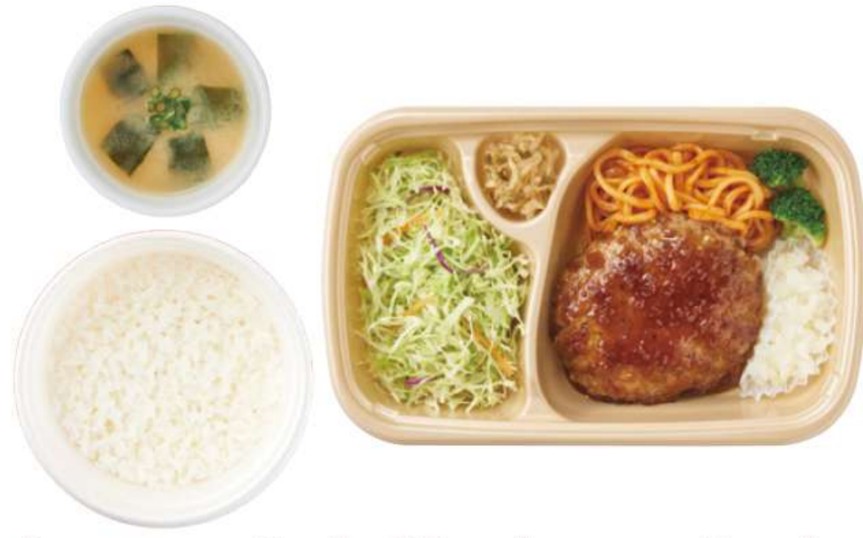
Japanese-Style Hamburger Steak with Grated Daikon With rice and miso soup ¥ 860