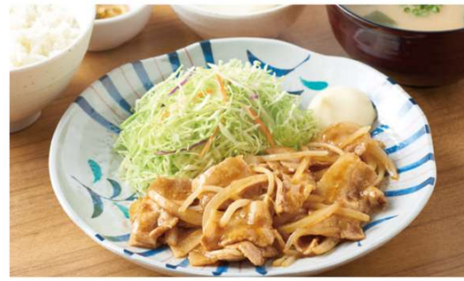
Ginger Pork Teishoku