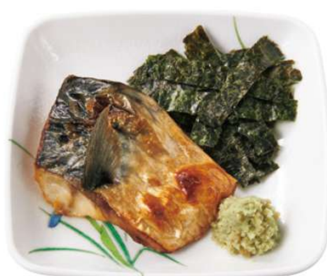
Mini Mackerel Side Dish (for Rice in Stock Broth) ¥ 150