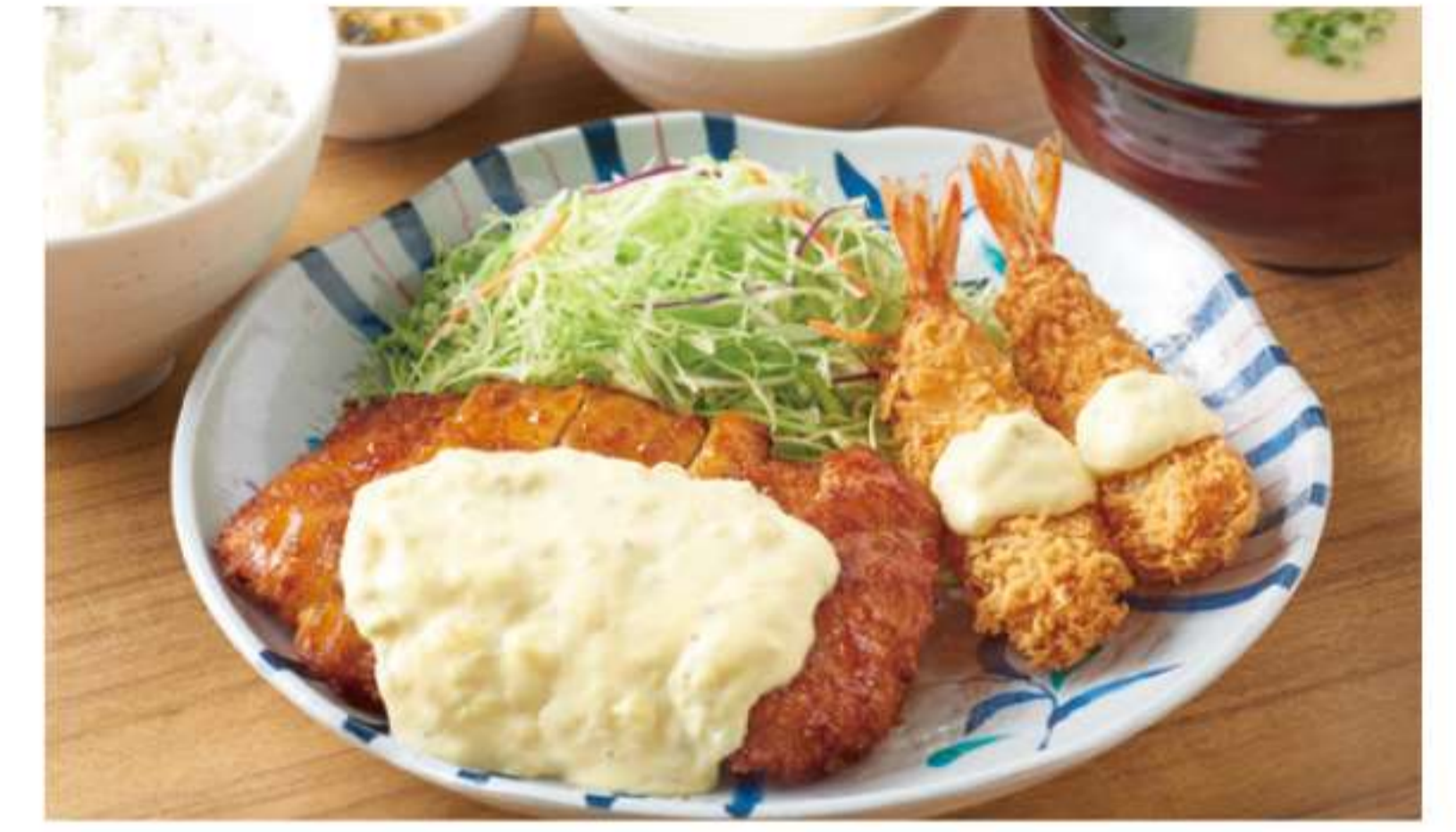
Fried Chicken with Tartar Sauce & Deep-Fried Prawns Teishoku