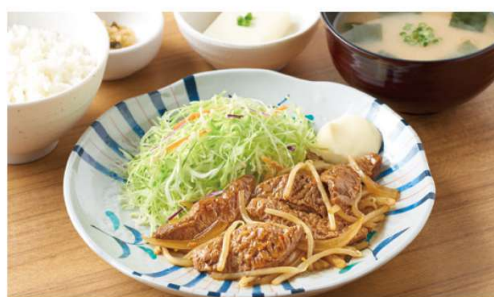
Ginger Soy Meat Teishoku