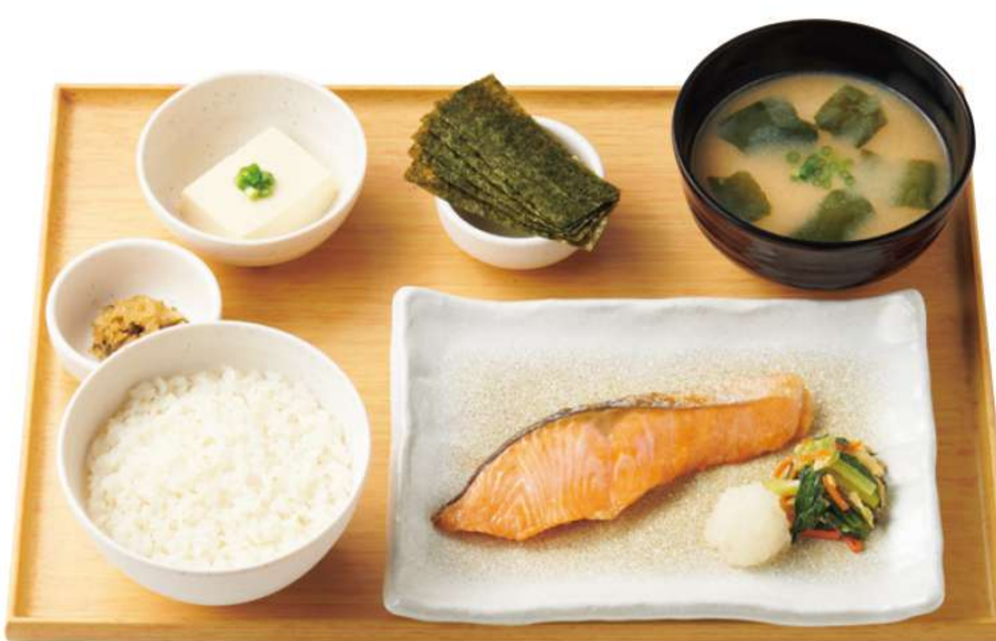
Salt-Grilled Salmon Breakfast Teishoku

(Breakfast menu options are served from 5:00-11:00 a.m. at 24-hour restaurants. For other restaurants, please inquire at the restaurant.)