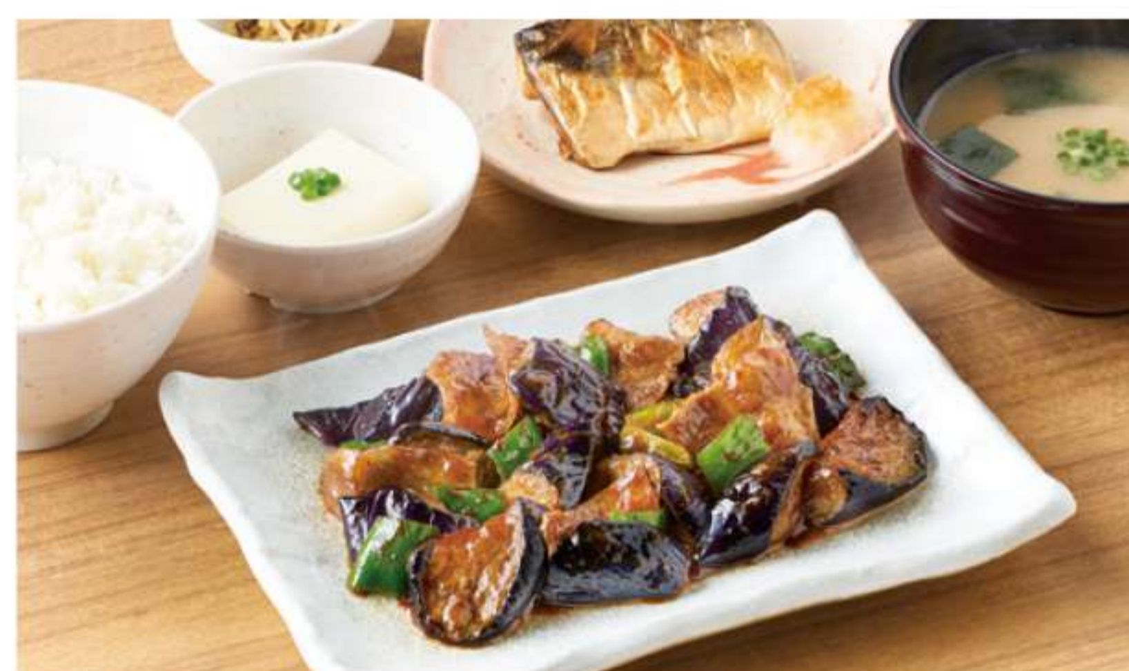
Stir-Fried Pork and Eggplant in Miso Sauce with Grilled Fish Teishoku