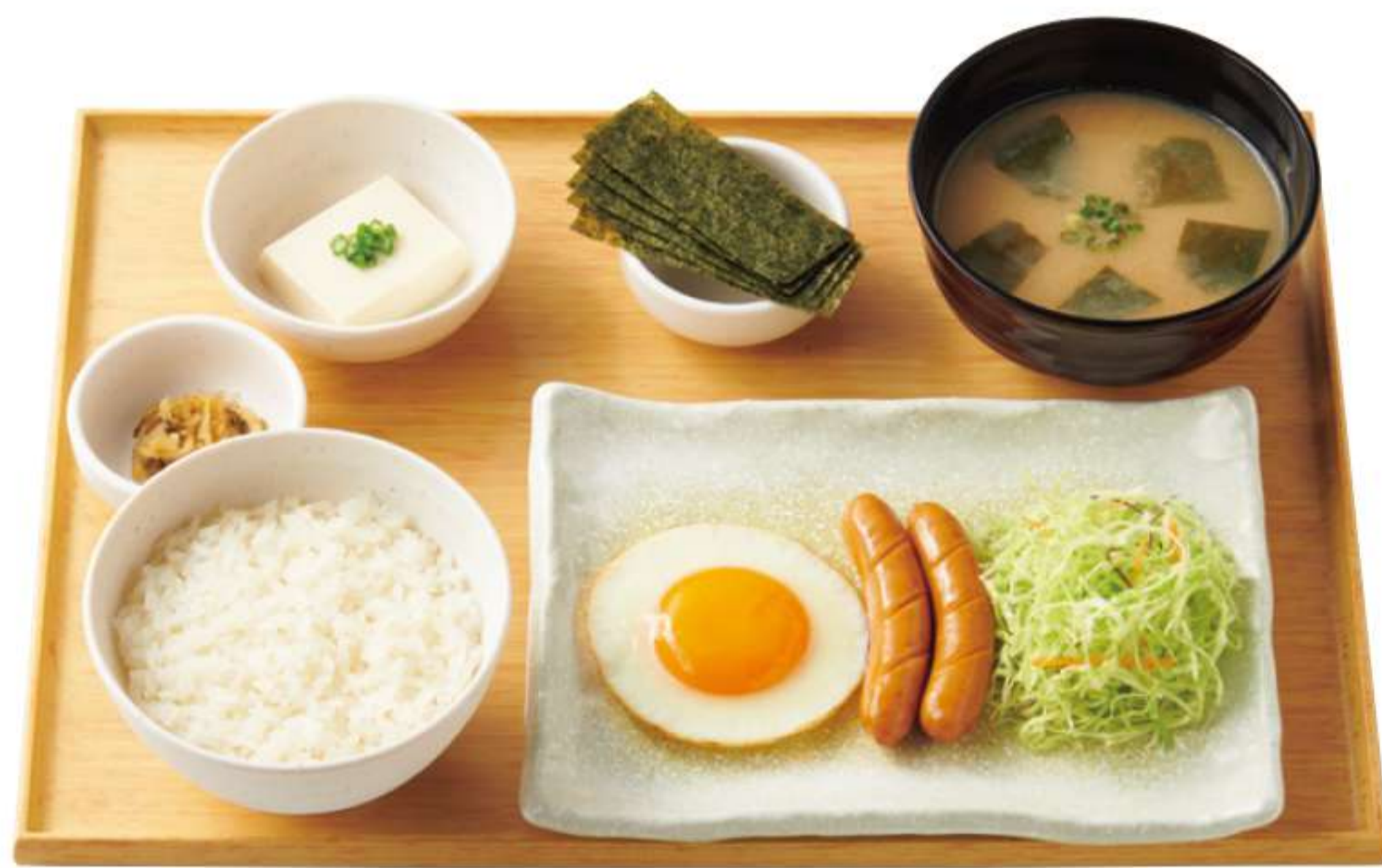
Fried Egg Breakfast Teishoku

(Breakfast menu options are served from 5:00-11:00 a.m. at 24-hour restaurants. For other restaurants, please inquire at the restaurant.)