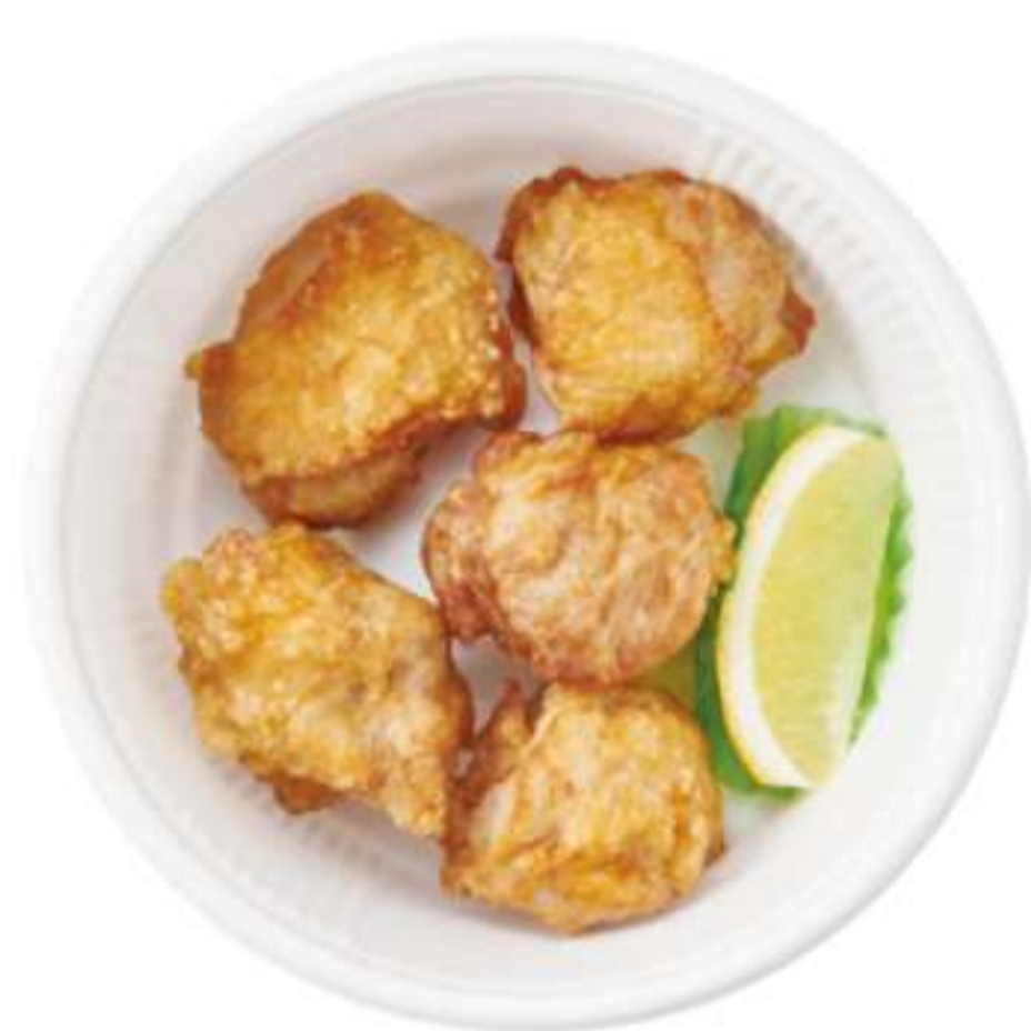
Deep-Fried Chicken (5 pcs.) ¥ 520