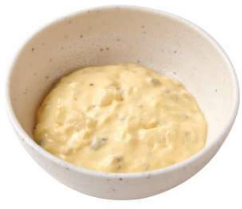
Tartar Sauce (à la carte) ¥ 50