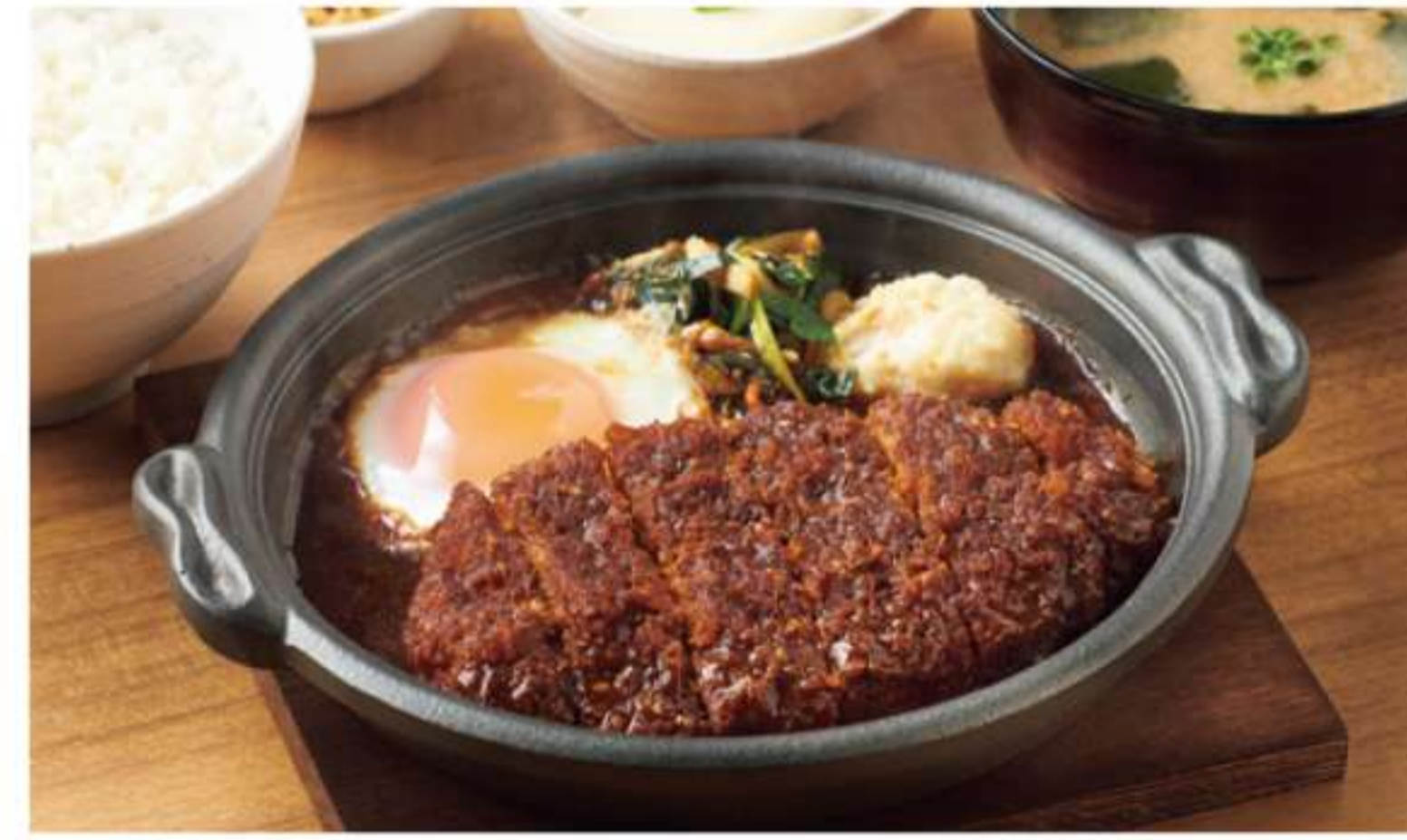
Pork Cutlet Simmered in Miso Sauce Teishoku