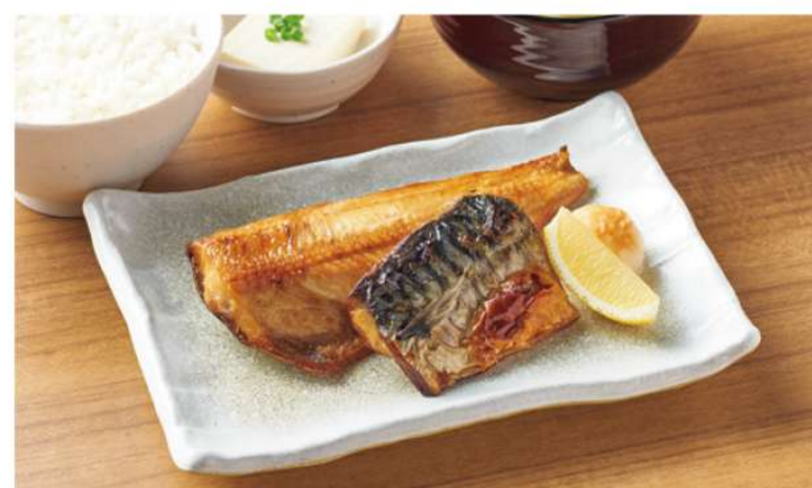
Grilled Atka Mackerel and Salt-Grilled Mackerel Teishoku