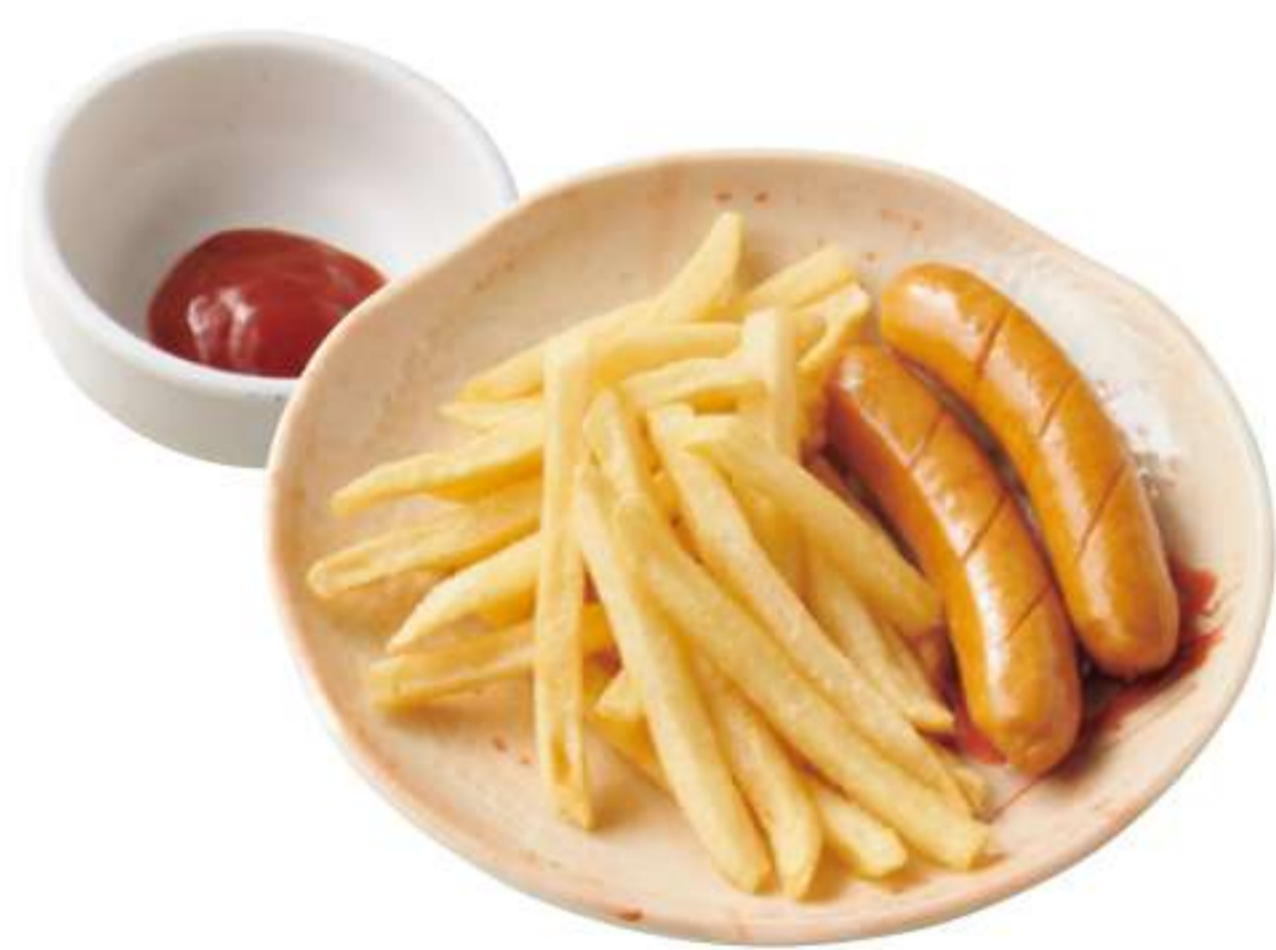
French Fries and Wieners ¥ 250