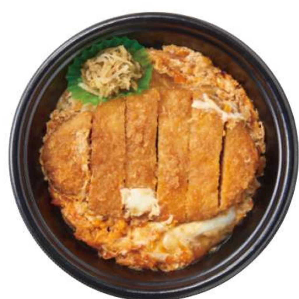
Pork Cutlet and Egg Rice Bowl ¥ 670