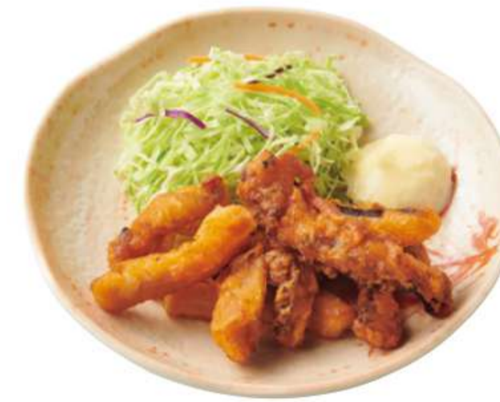
Deep-Fried Squid ¥ 220