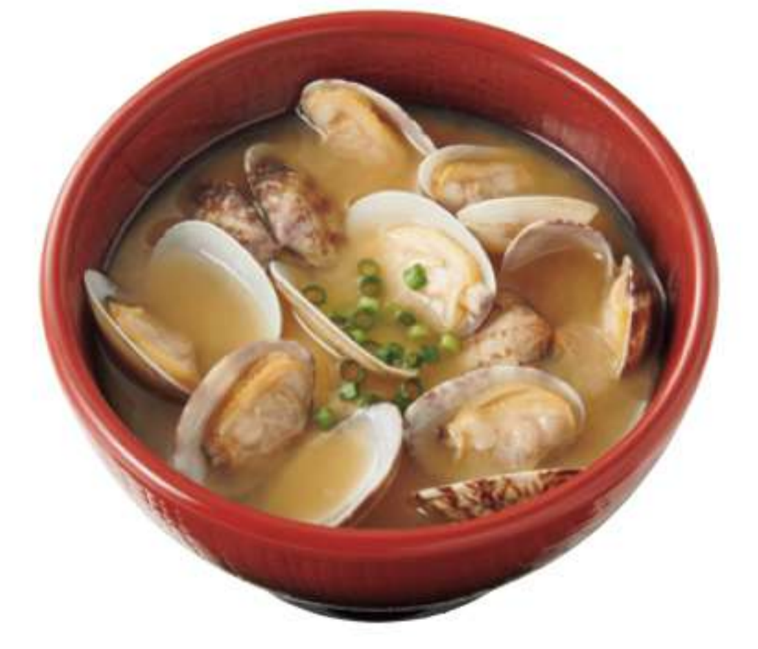
Clam Miso Soup (à la carte) ¥ 290