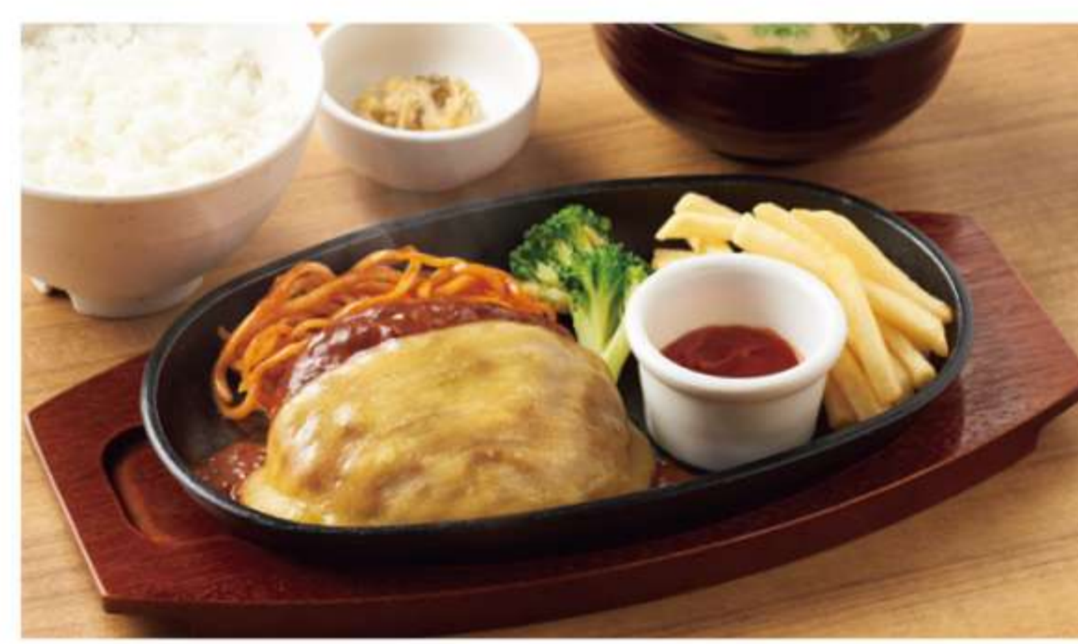
Four-Cheese Hamburger Steak Teishoku