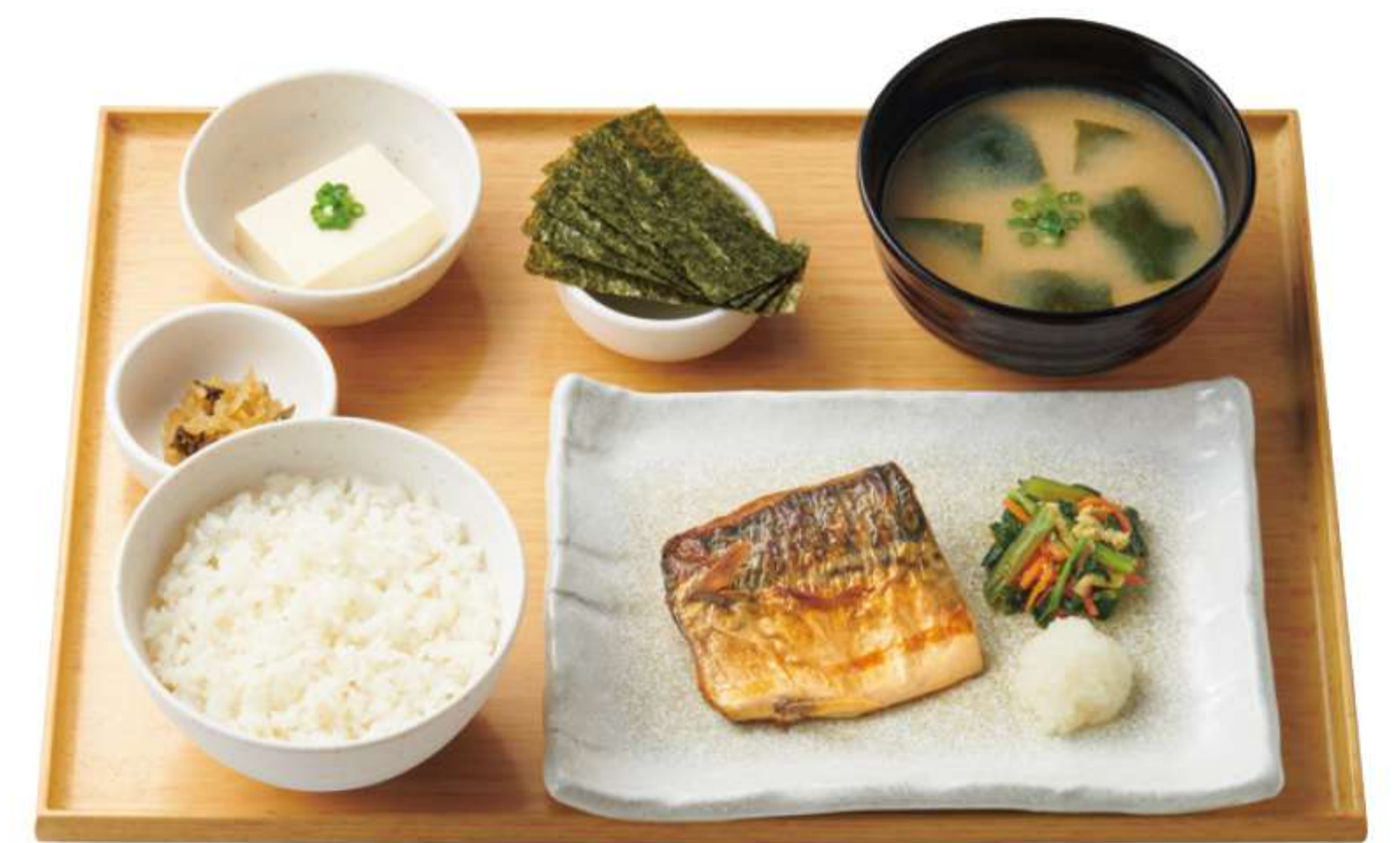
Salt-Grilled Mackerel Breakfast Teishoku

(Breakfast menu options are served from 5:00-11:00 a.m. at 24-hour restaurants. For other restaurants, please inquire at the restaurant.)