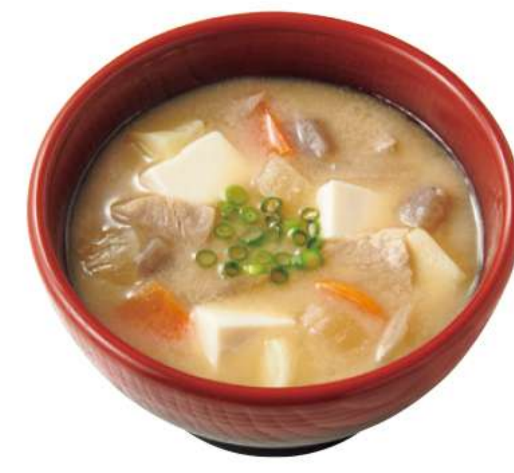
Pork miso soup (à la carte) ¥ 290