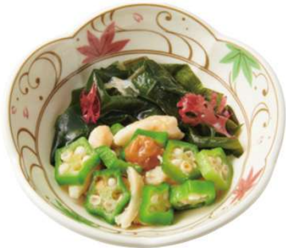
Steamed Chicken and Seaweed with Ponzu Sauce Side Dish ¥ 120