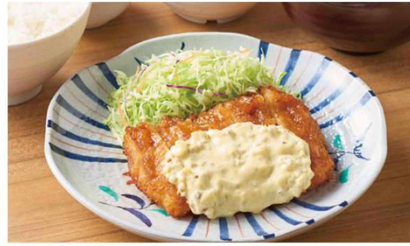
Fried Chicken with Tartar Sauce Teishoku