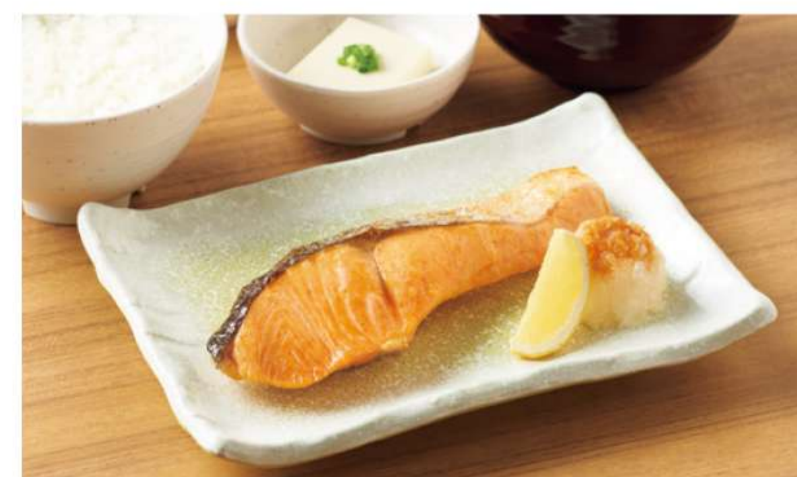
Salt-Grilled Silver Salmon Teishoku