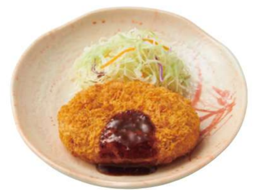
Potato Croquette (à la carte) ¥ 150