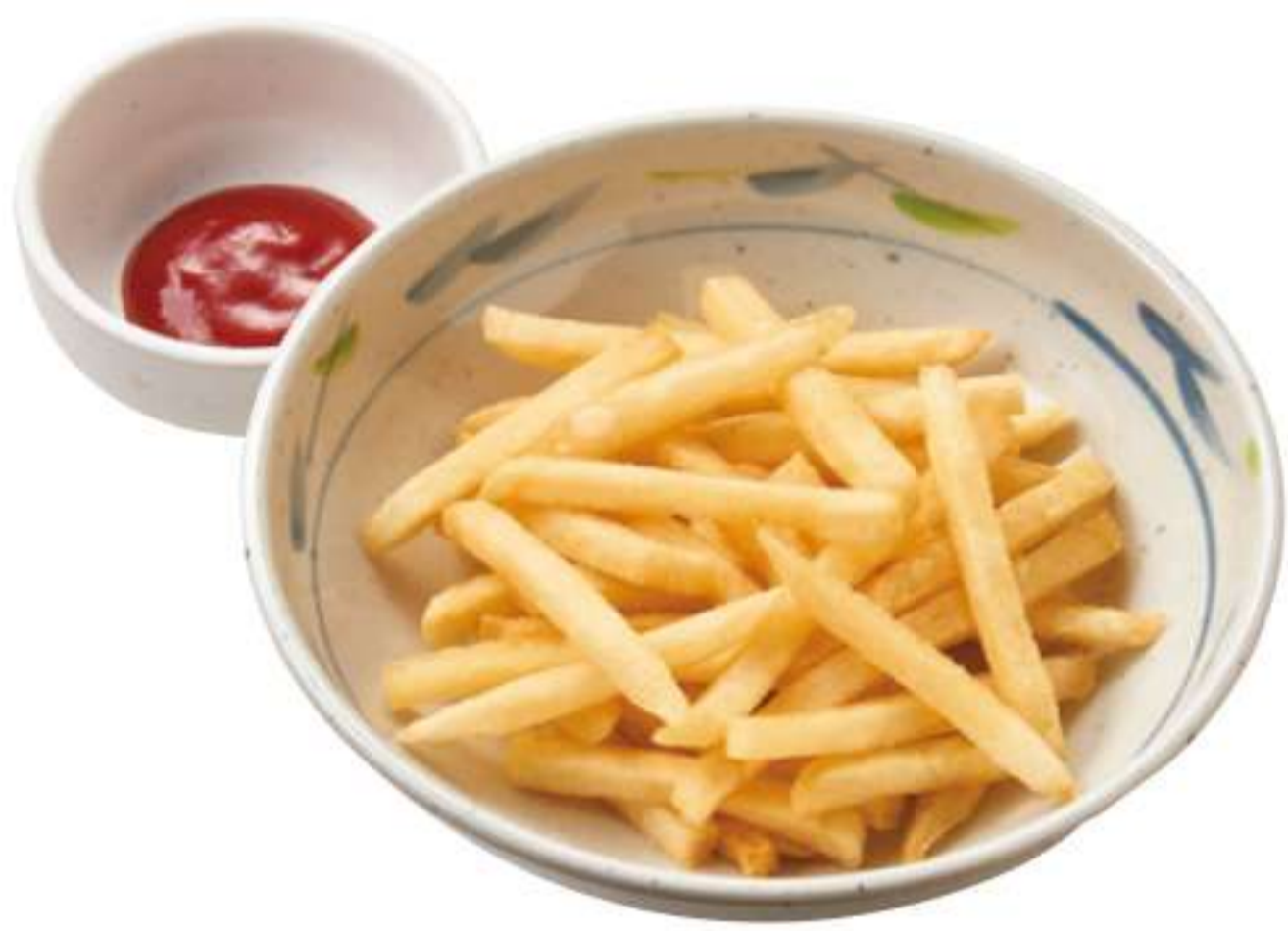
French Fries ¥ 220