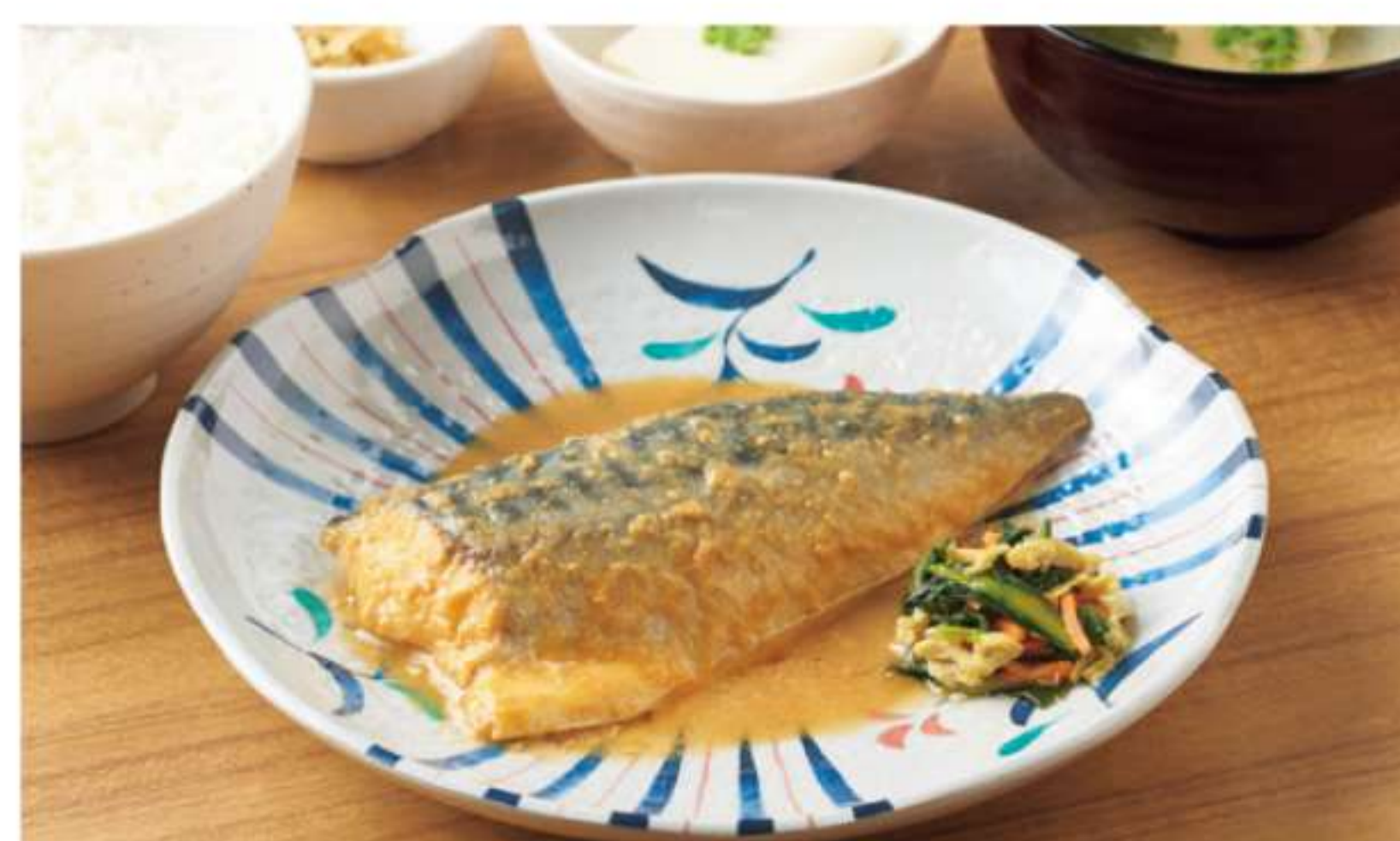
Mackerel Simmered in Miso Teishoku