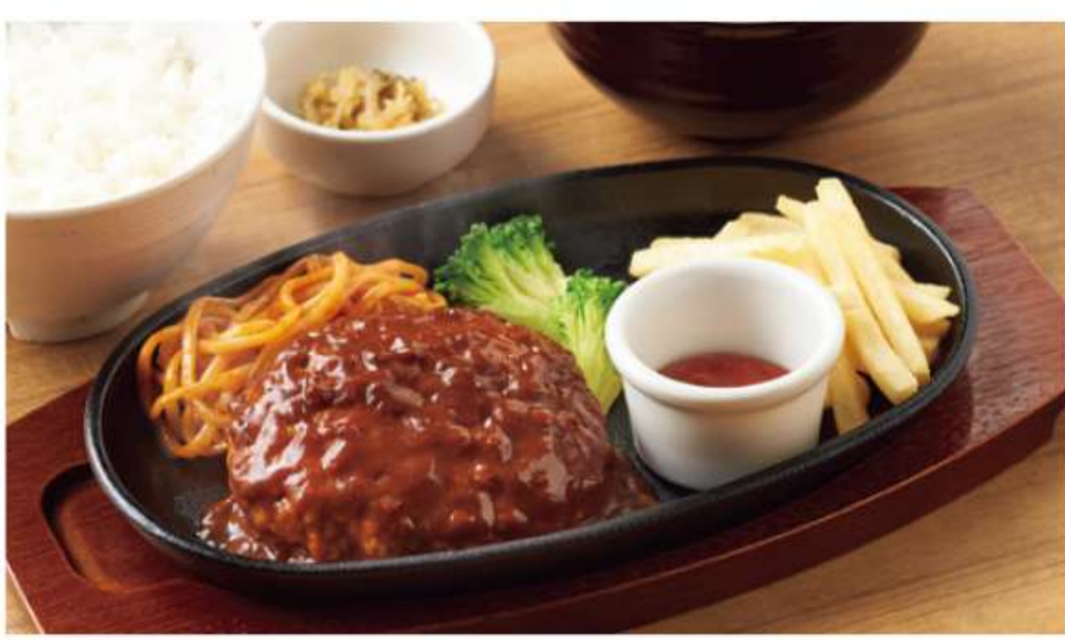
Demi-Glace Hamburger Steak Teishoku