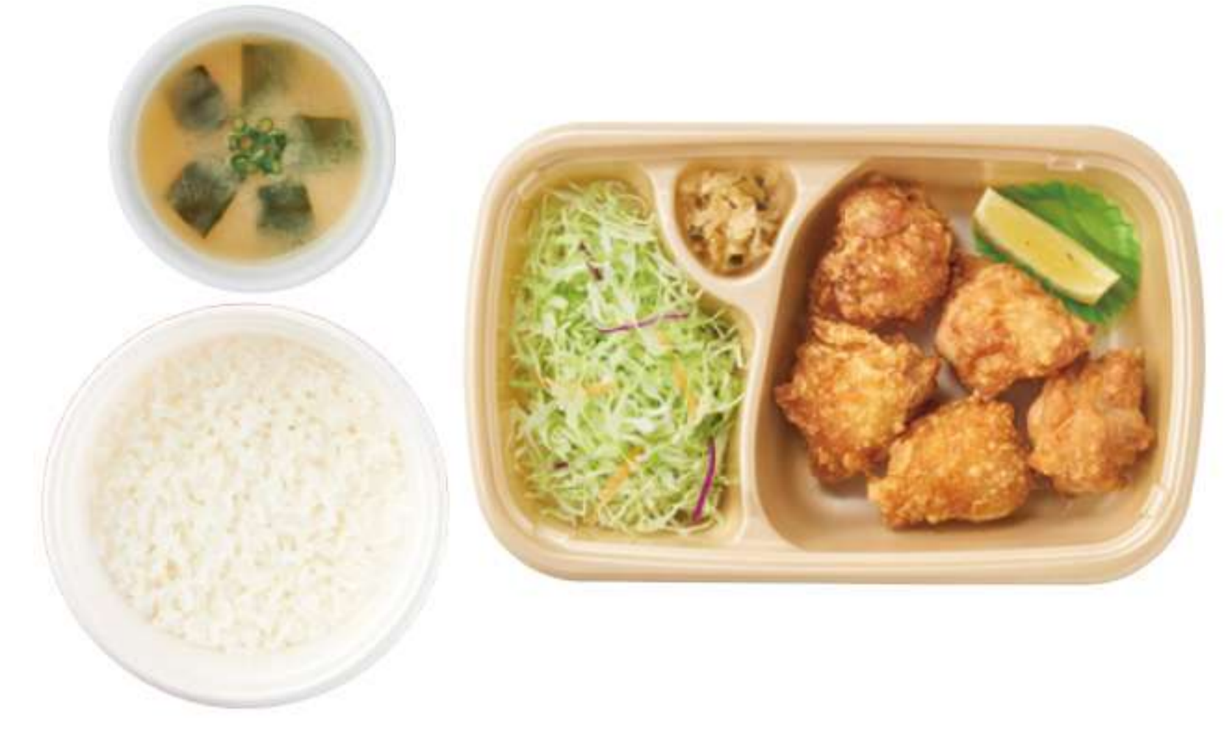
Deep-Fried Chicken With rice and miso soup ¥ 790