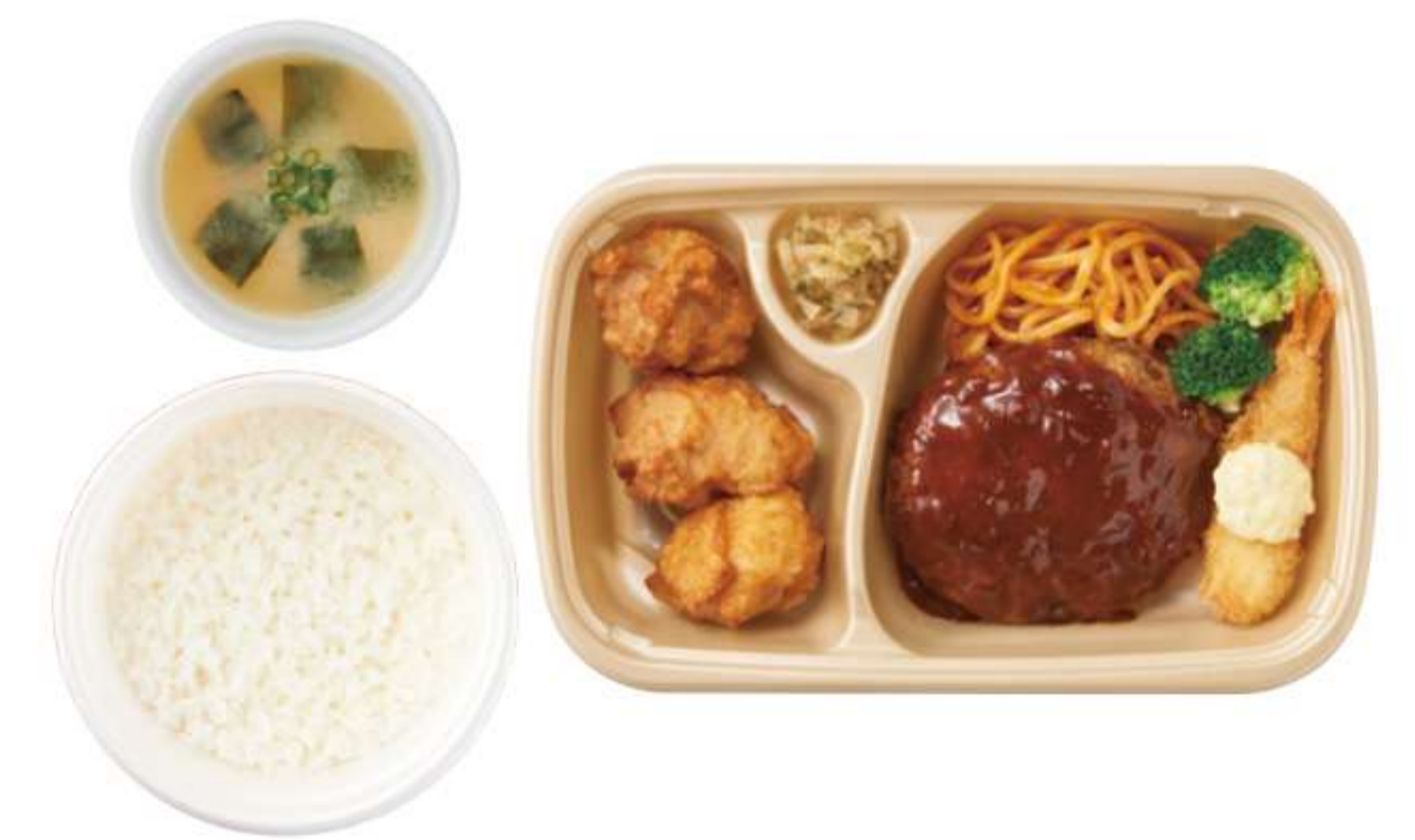
Hamburger Steak, Deep-Fried Prawn and Deep-Fried Chicken With rice and miso soup ¥ 1,150