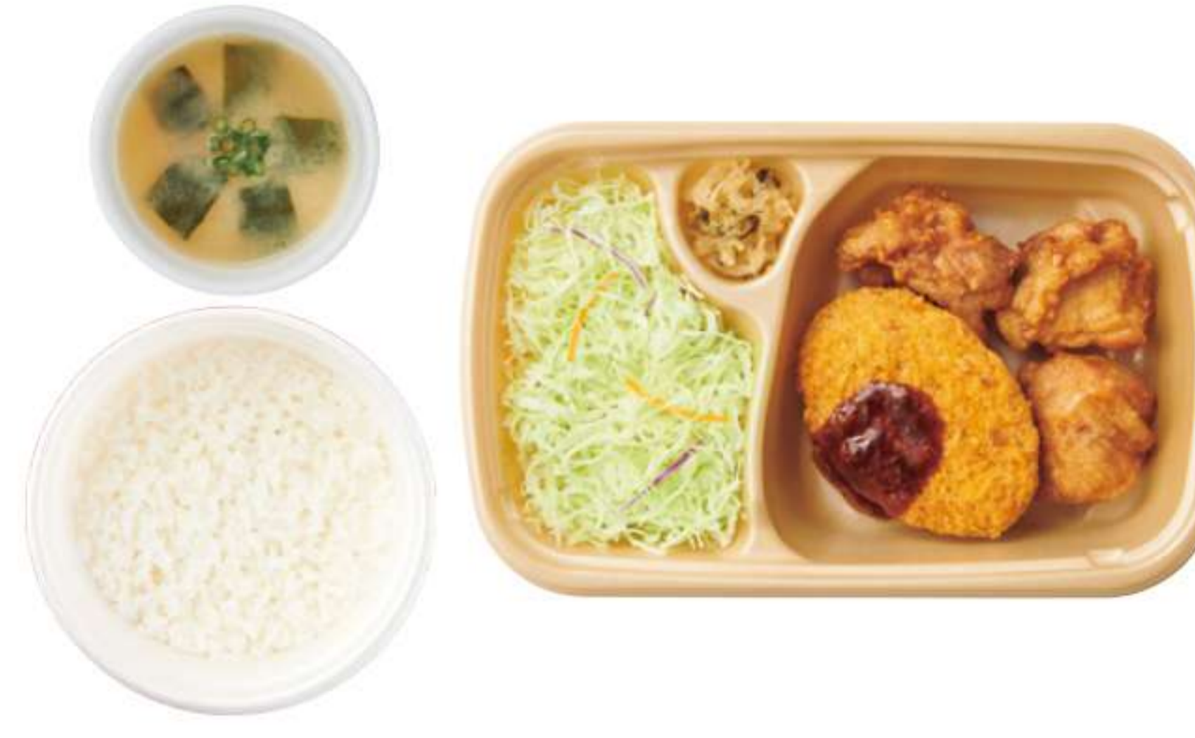
Deep-Fried Chicken & Potato Croquette With rice and miso soup ¥ 790