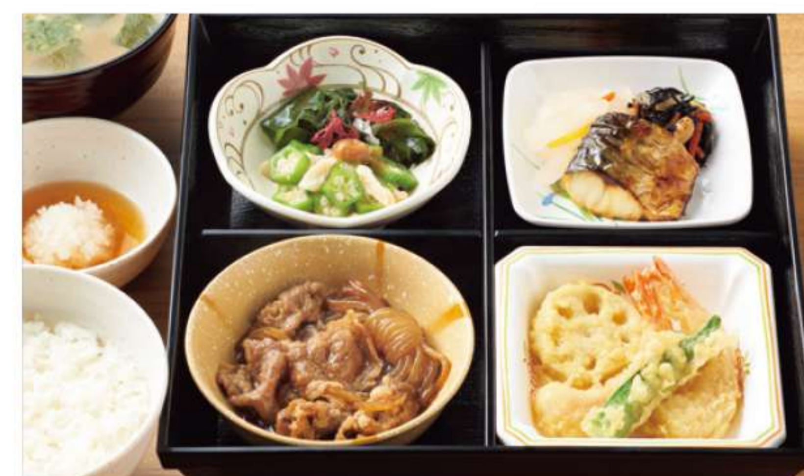
Yayoi Gozen (Tempura)