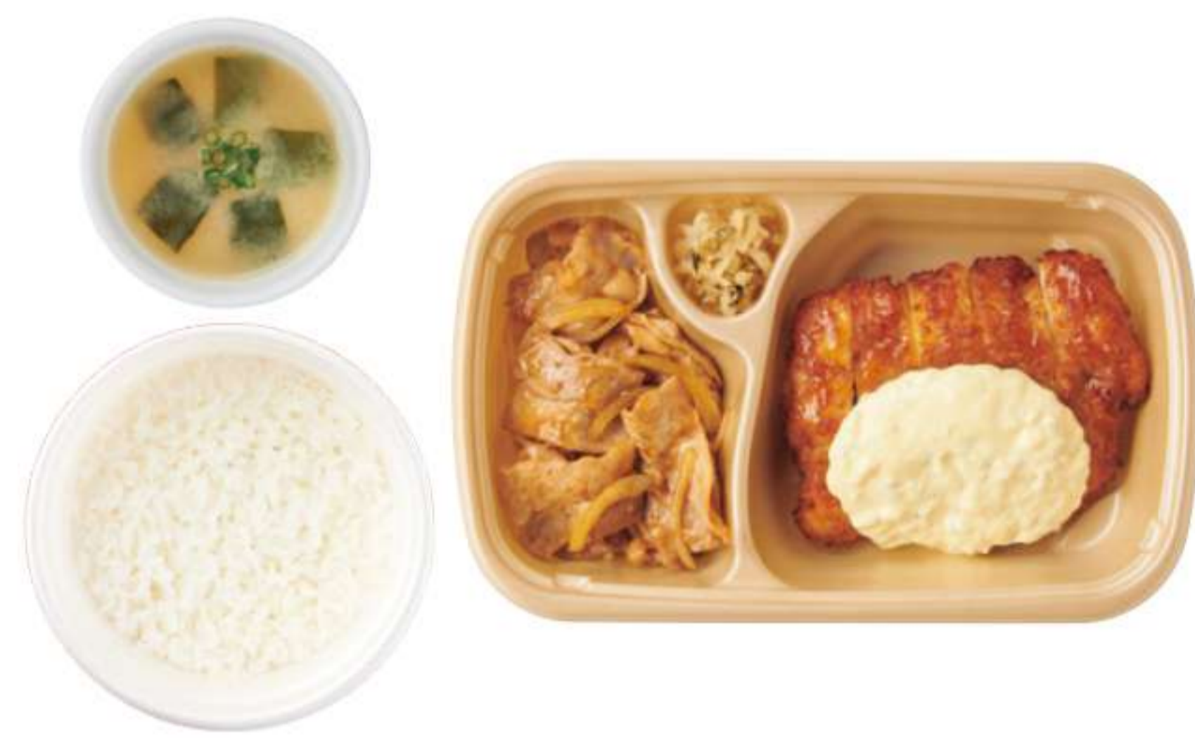
Fried Chicken with Tartar Sauce and Ginger Pork With rice and miso soup ¥ 1,150