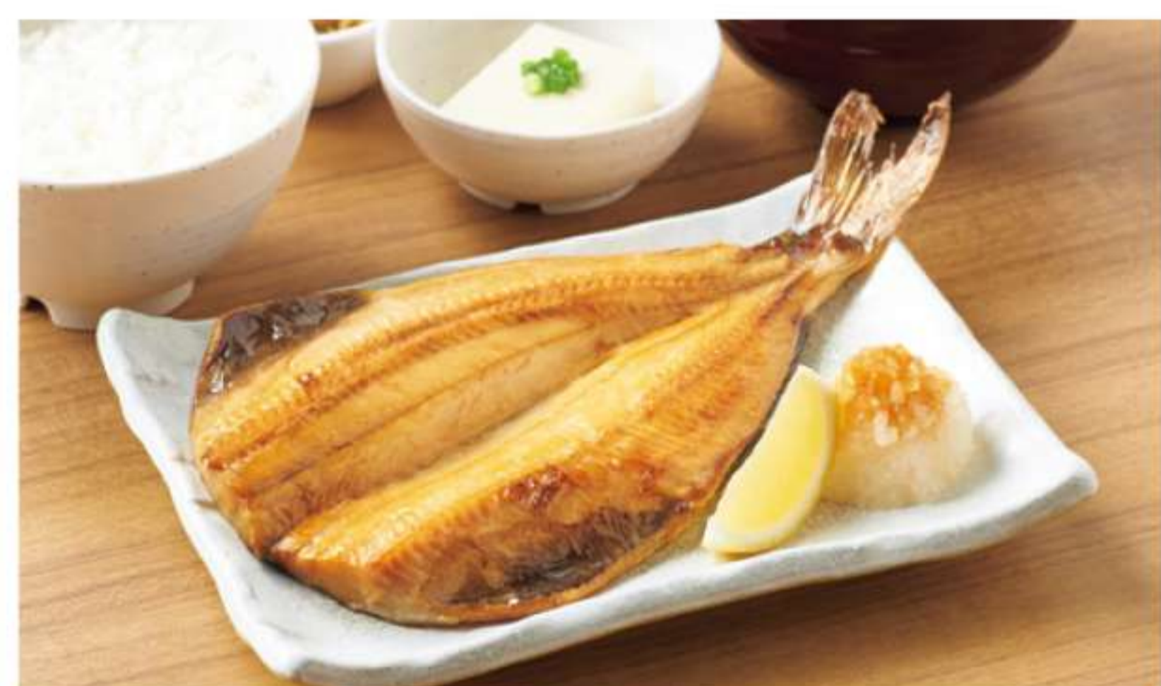
Grilled Atka Mackerel Teishoku