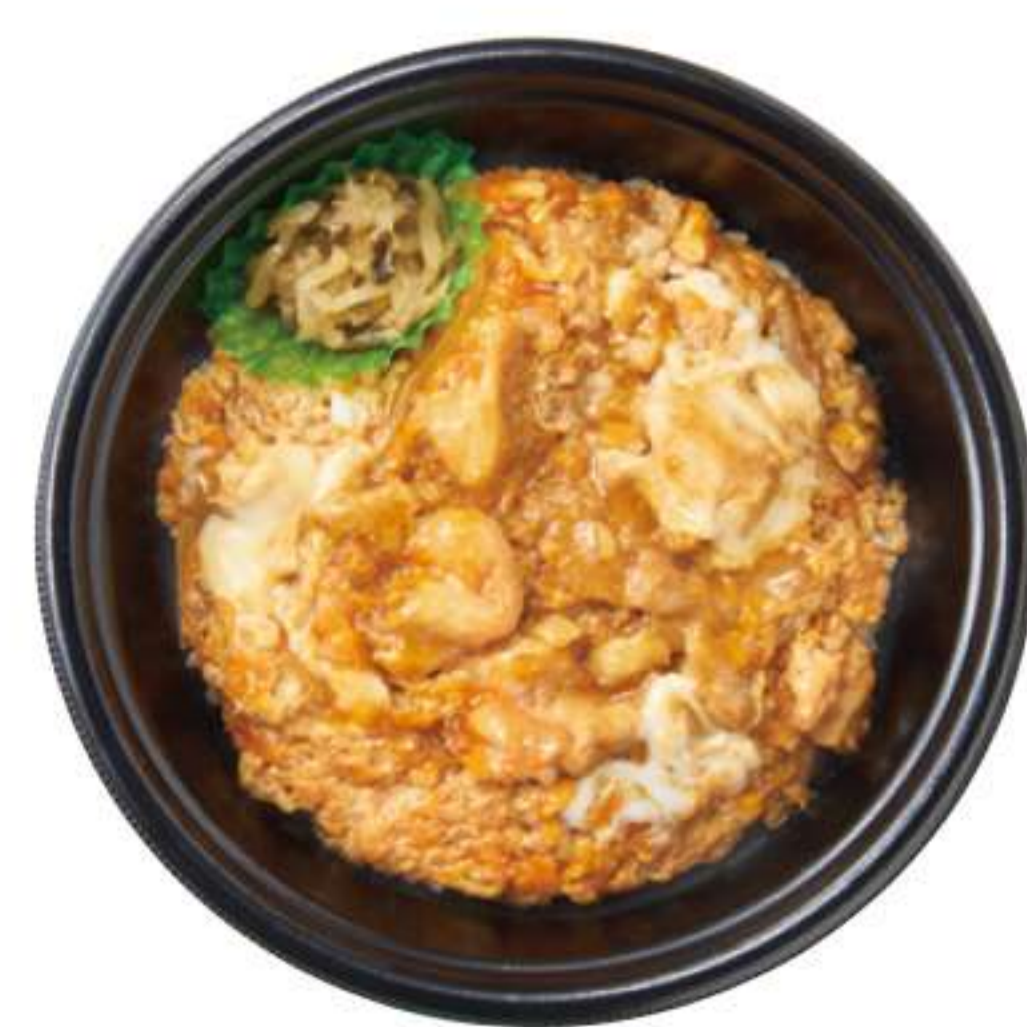
Awao Chicken and Egg Rice Bowl ¥ 660