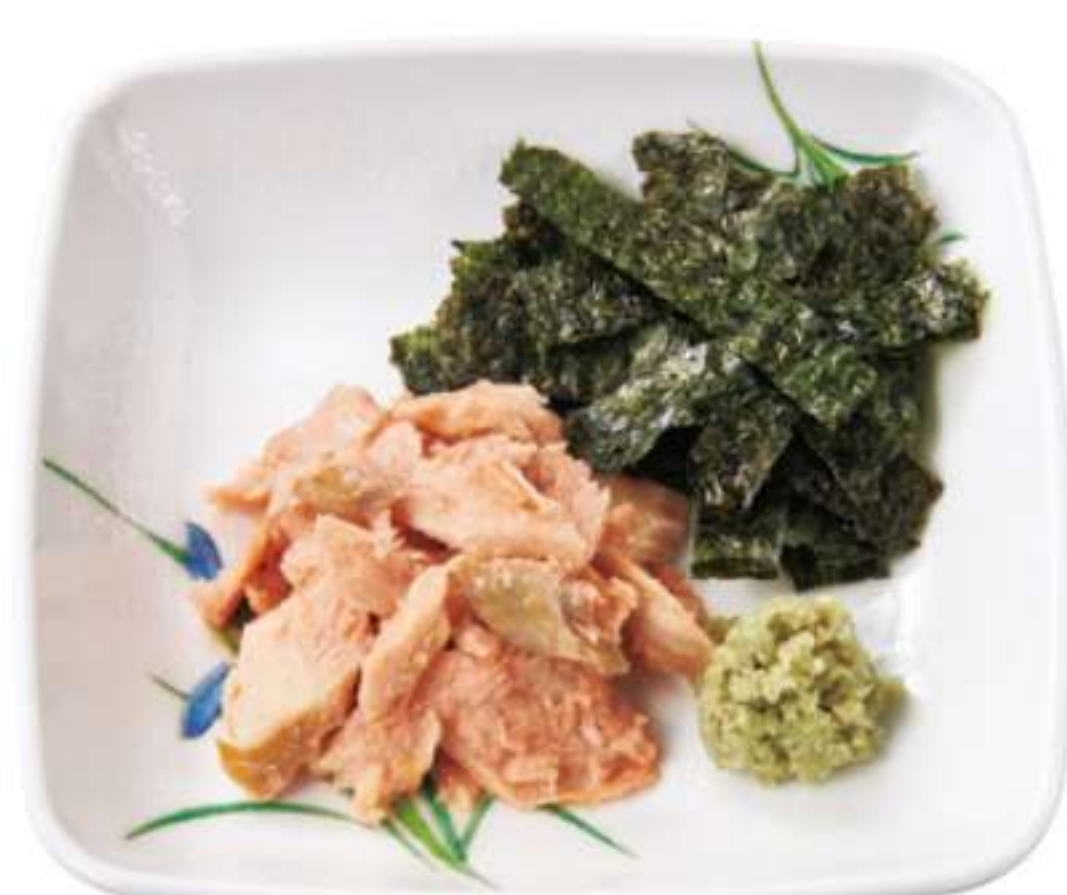
Flaked Salmon Side Dish (for Rice in Stock Broth) ¥ 150