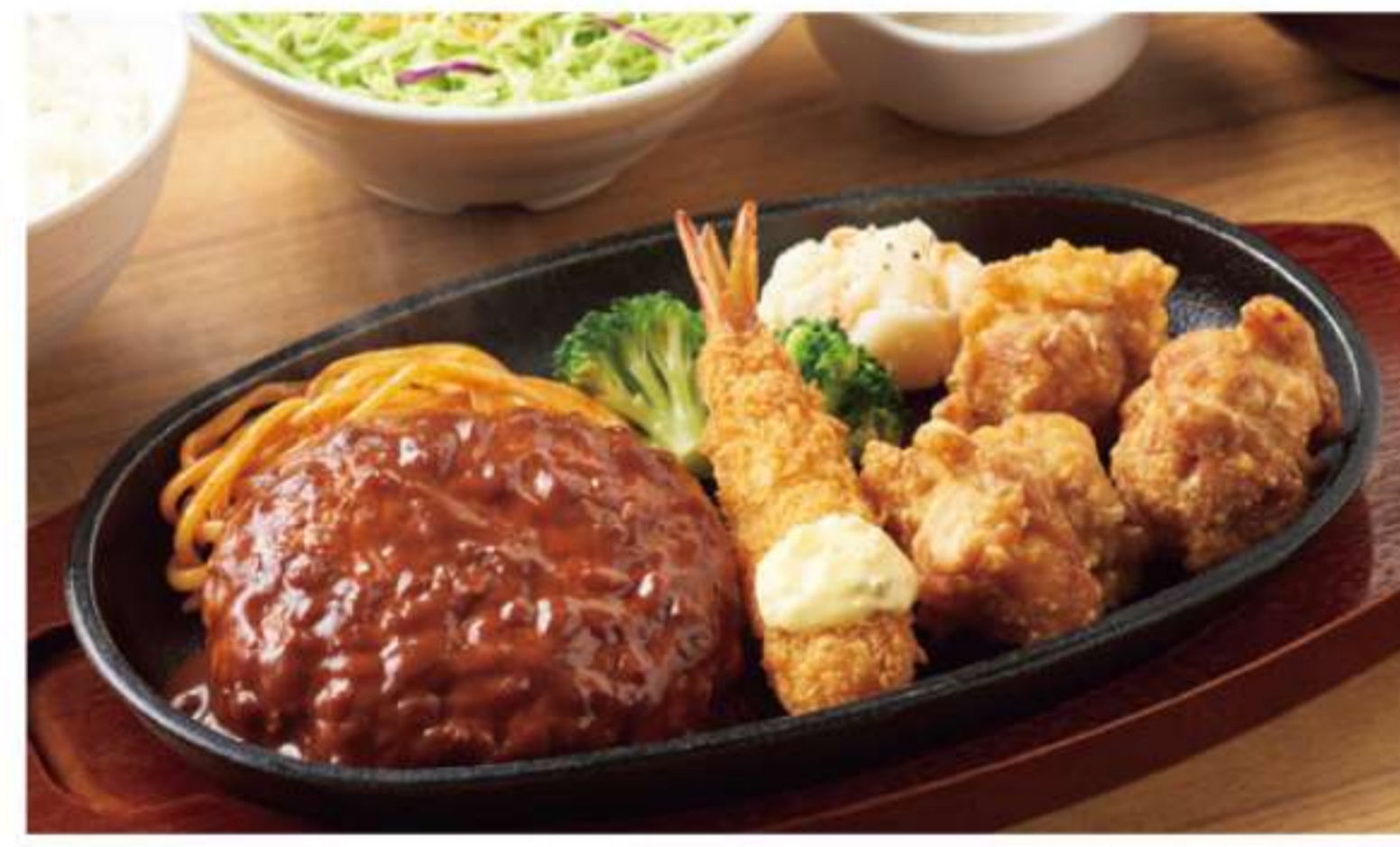
Hamburger Steak, Deep-Fried Prawn and Deep-Fried Chicken Teishoku