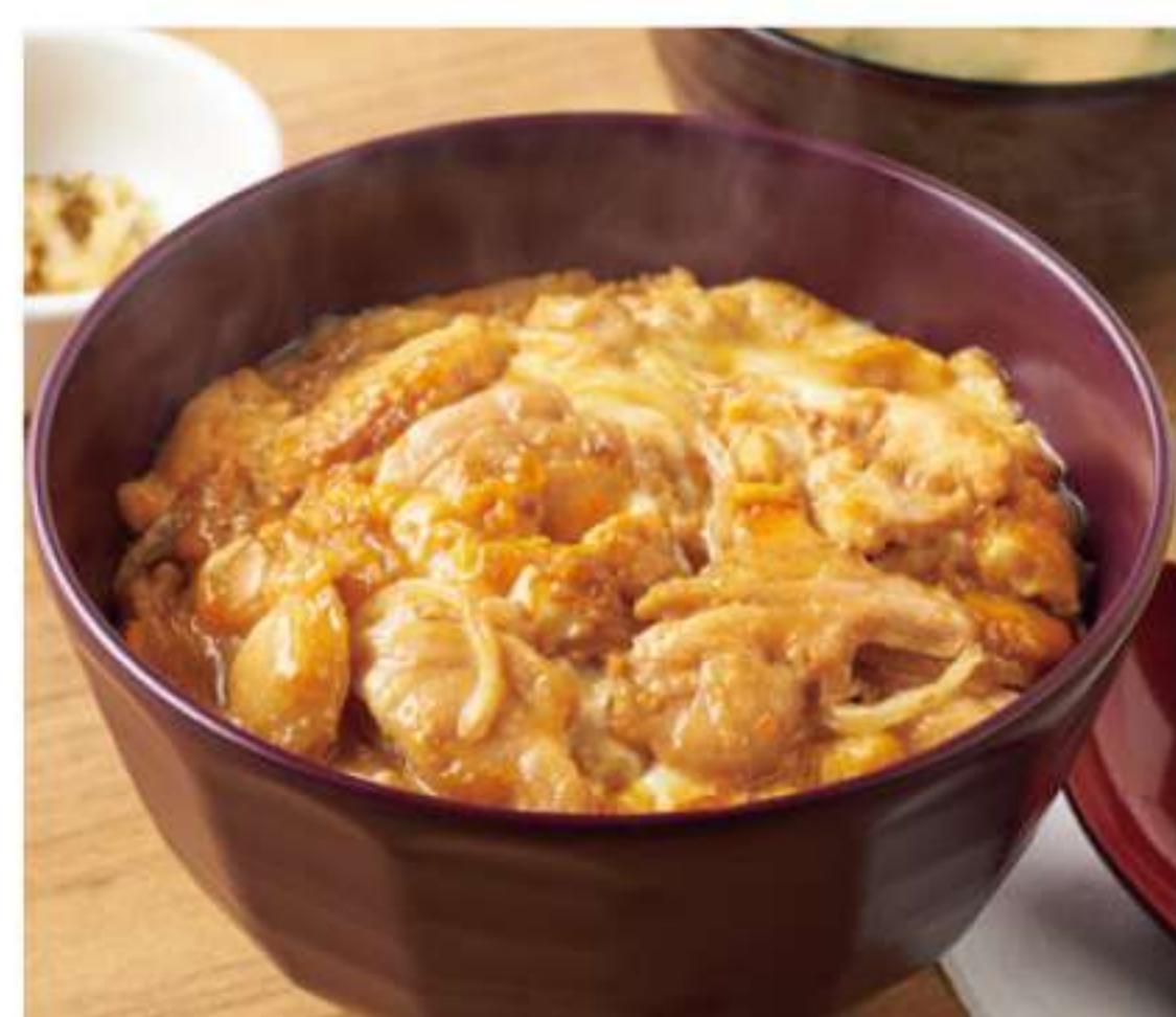
Awao Chicken and Egg Rice Bowl (with Miso Soup)