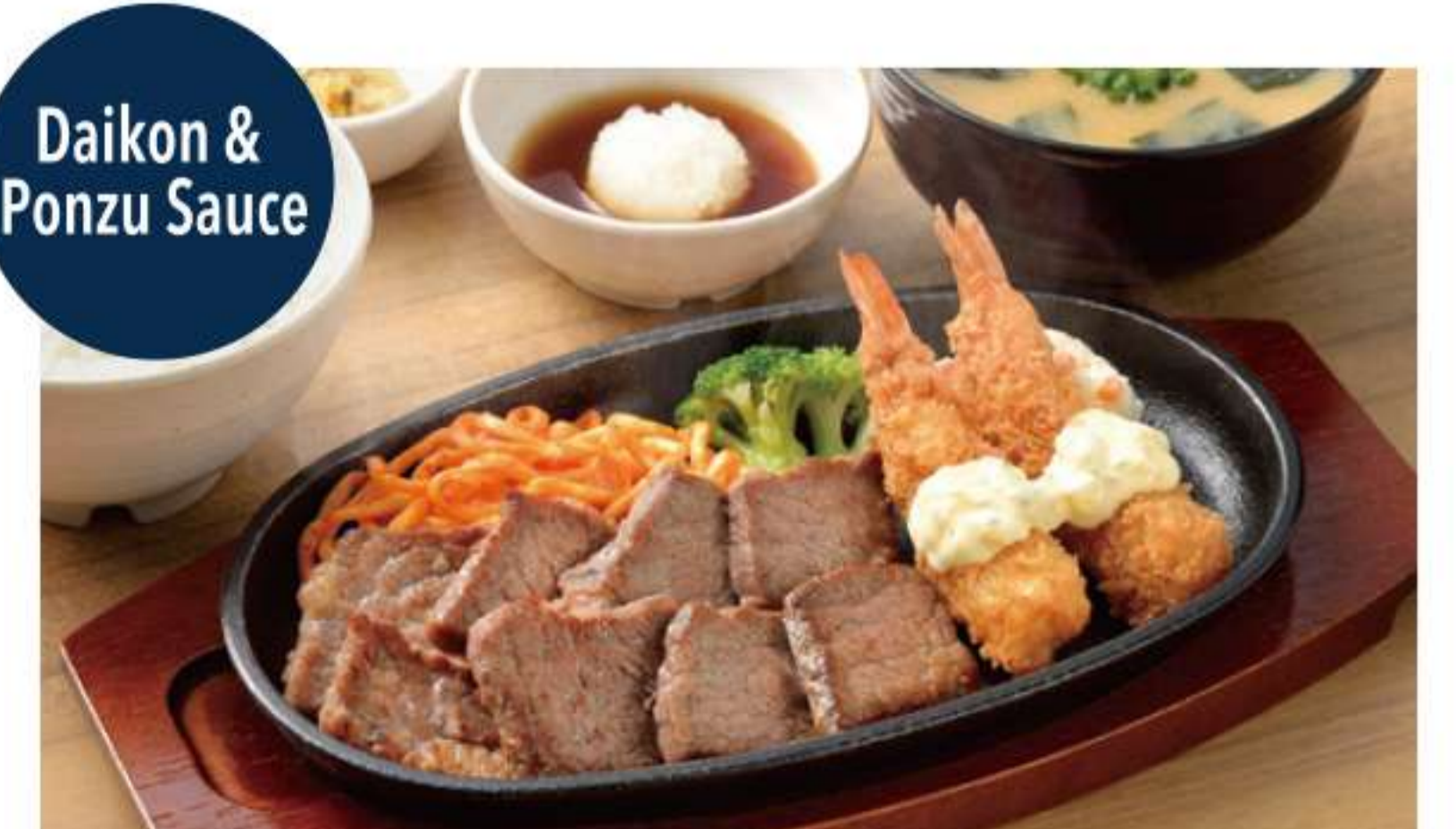
Black Angus Cut Steak and Deep-Fried Prawn Teishoku