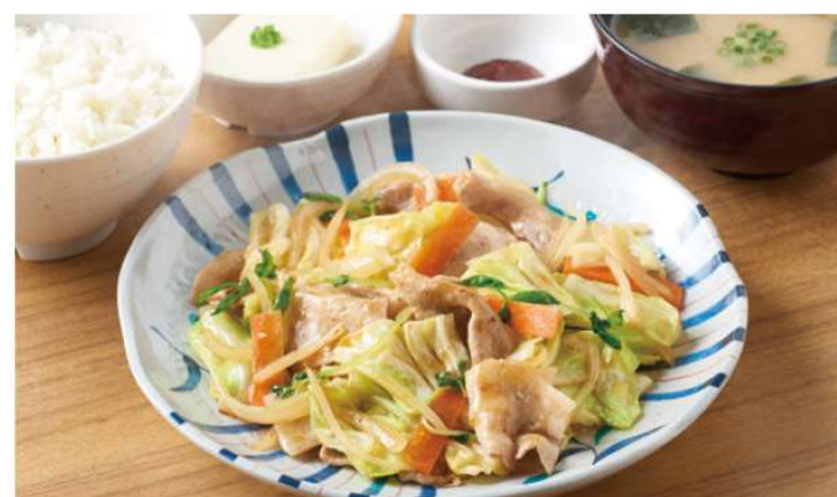
Stir-Fried Pork and Vegetables Teishoku