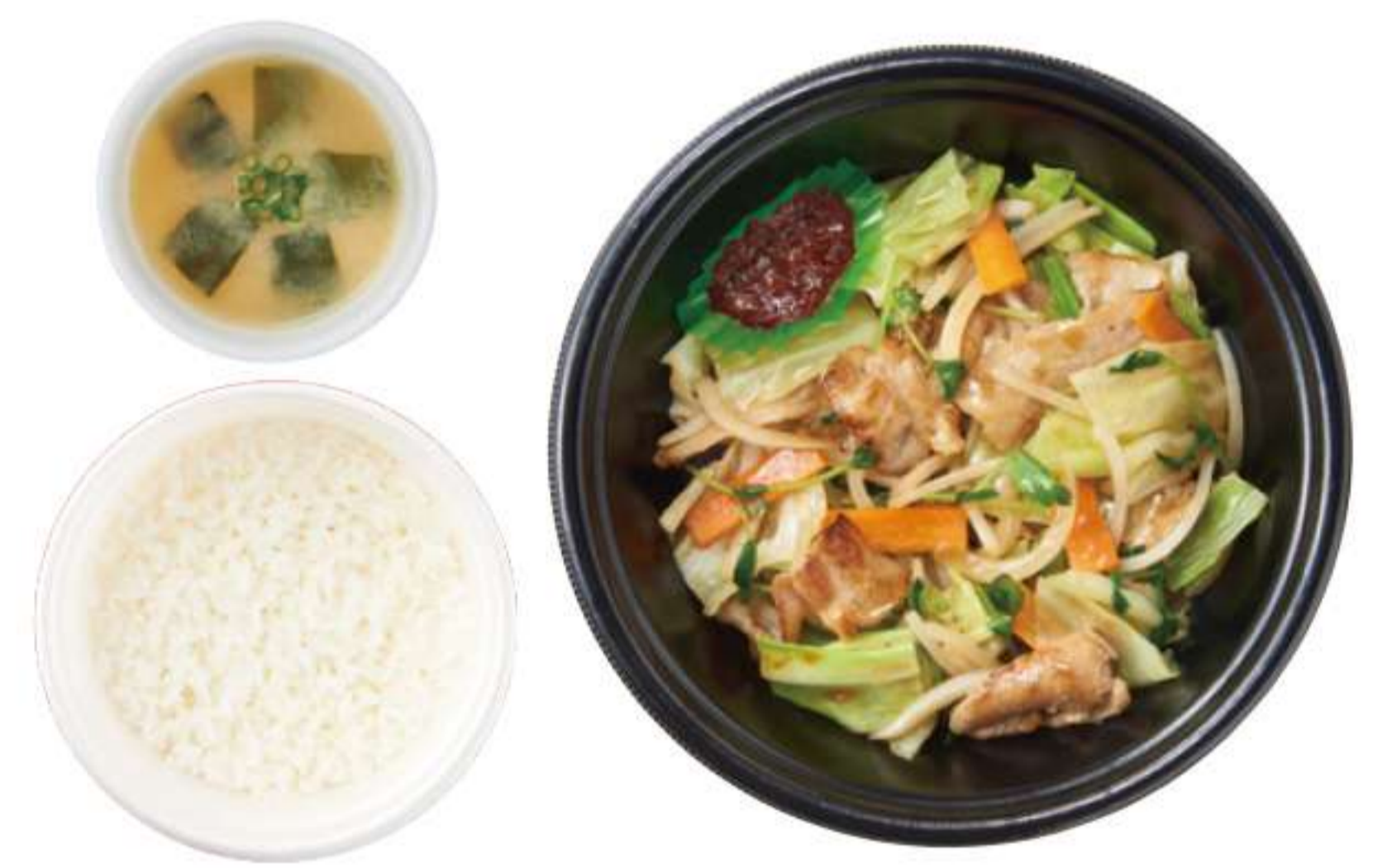
Stir-Fried Pork and Vegetables With rice and miso soup ¥ 820