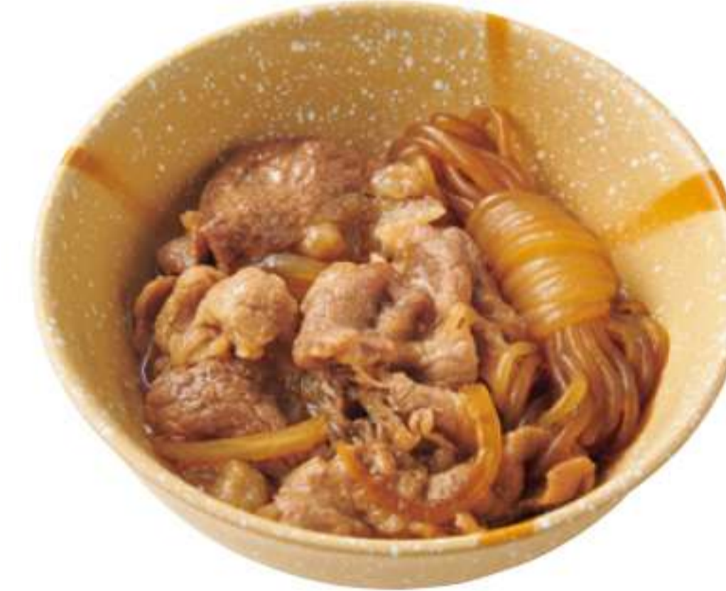
Beef Sukiyaki Side Dish ¥ 280