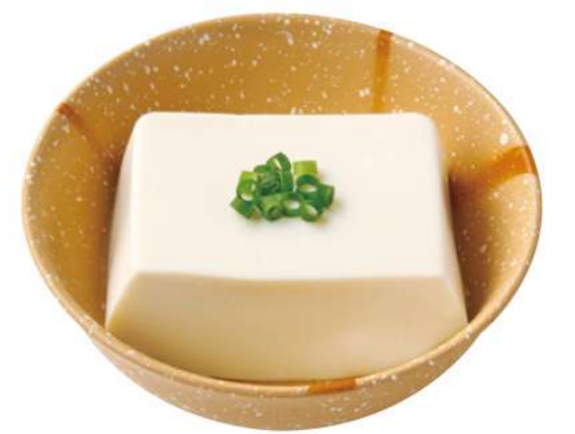
Chilled Tofu ¥ 100