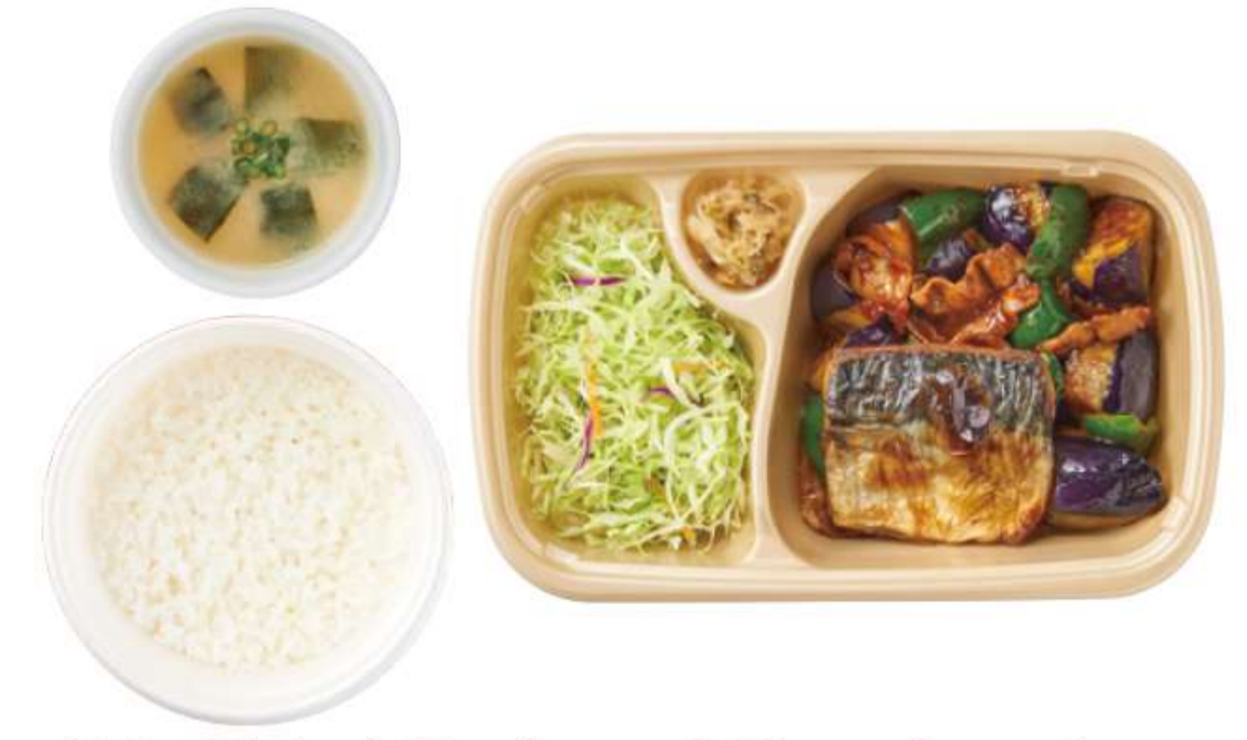
Stir-Fried Pork and Eggplant in Miso Sauce with Grilled Fish With rice and miso soup ¥ 1,020