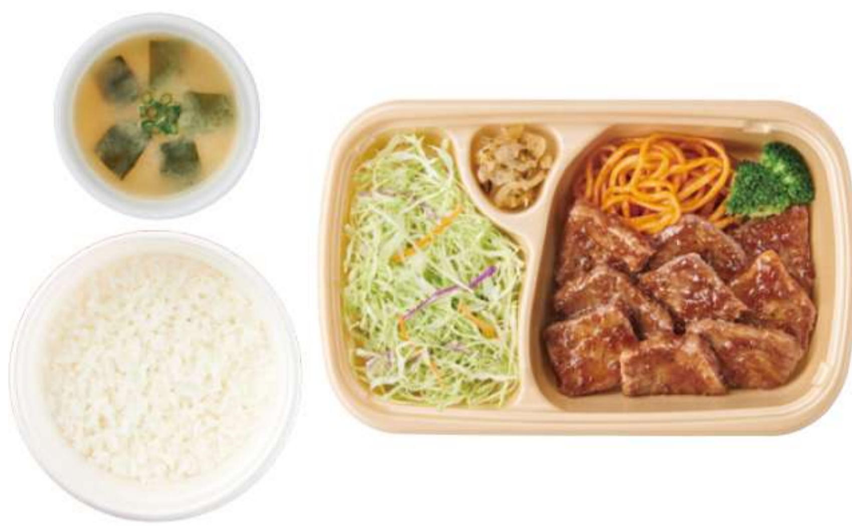
Black Angus Cut Steak With rice and miso soup ¥ 1,340