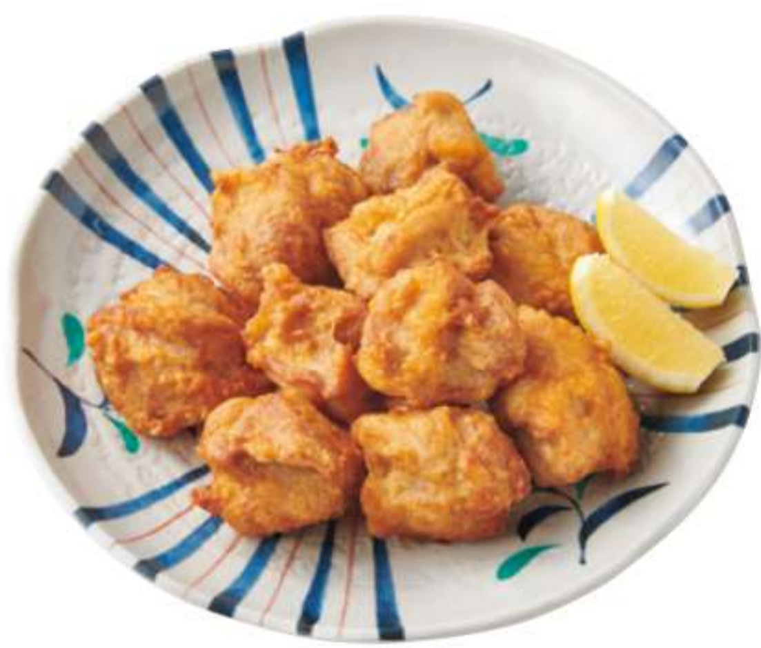
Deep-Fried Chicken (10 pcs.) ¥ 910