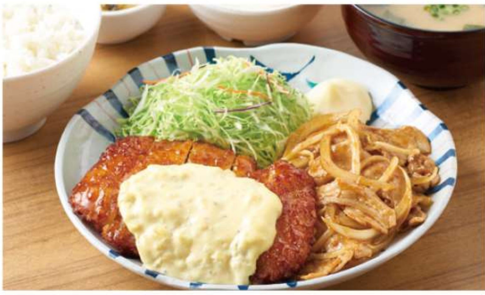
Fried Chicken with Tartar Sauce and Ginger Pork Teishoku