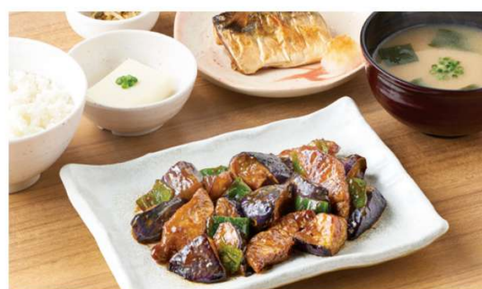
Stir-Fried Soy Meat and Eggplant in Miso Sauce & Grilled Fish Teishoku