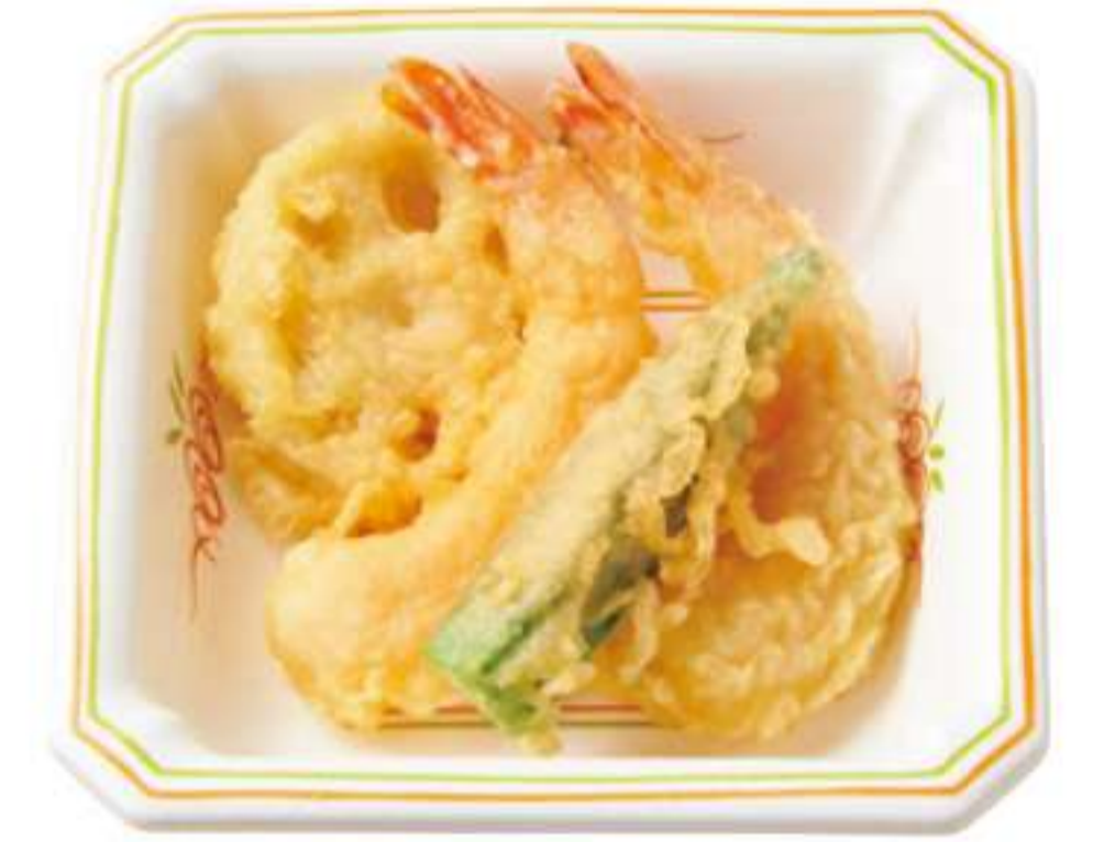
Tempura Side Dish ¥ 290