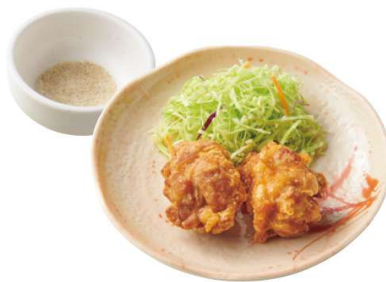
Mini Deep-Fried Chicken ¥ 240