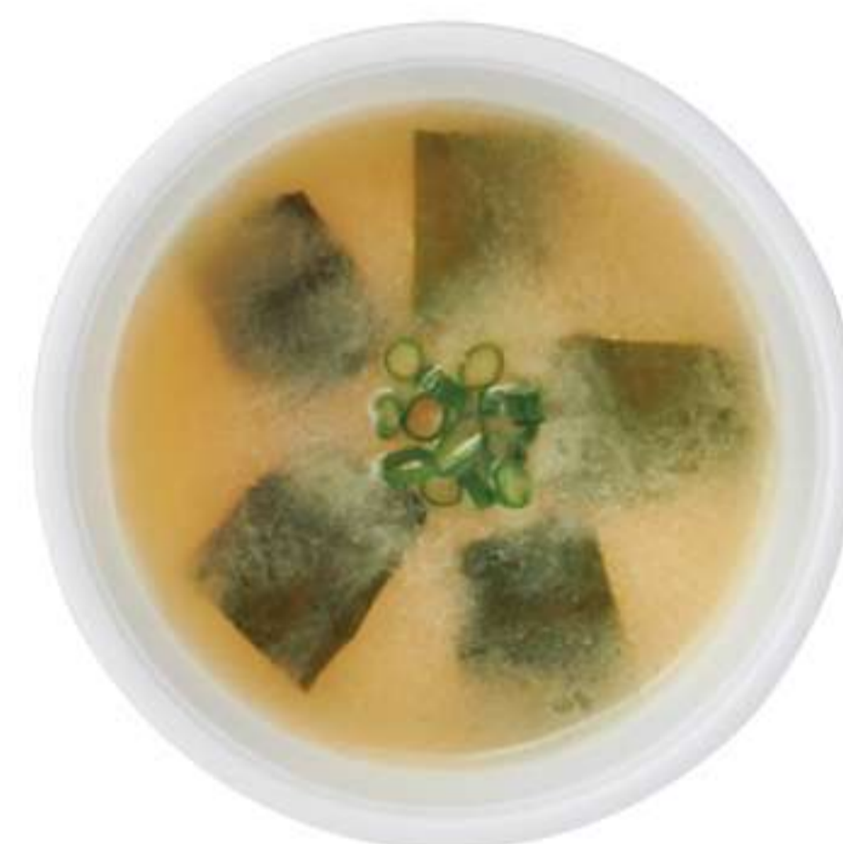
Miso Soup ¥ 100