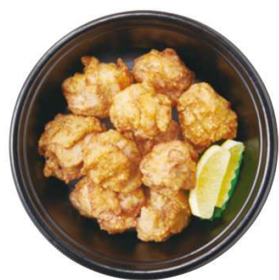
Deep-Fried Chicken (10 pcs.) ¥ 910