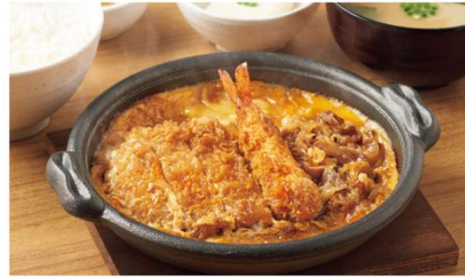
Mixed Fried Foods Topped with Egg Teishoku