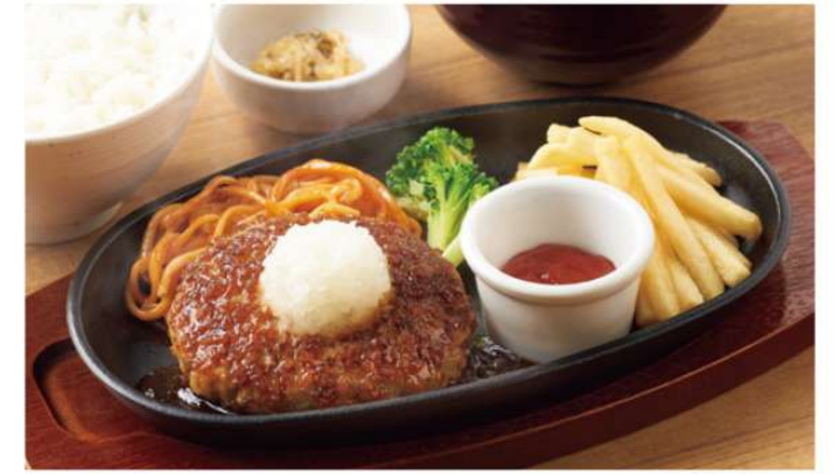
Japanese-Style Hamburger Steak with Grated Daikon Teishoku