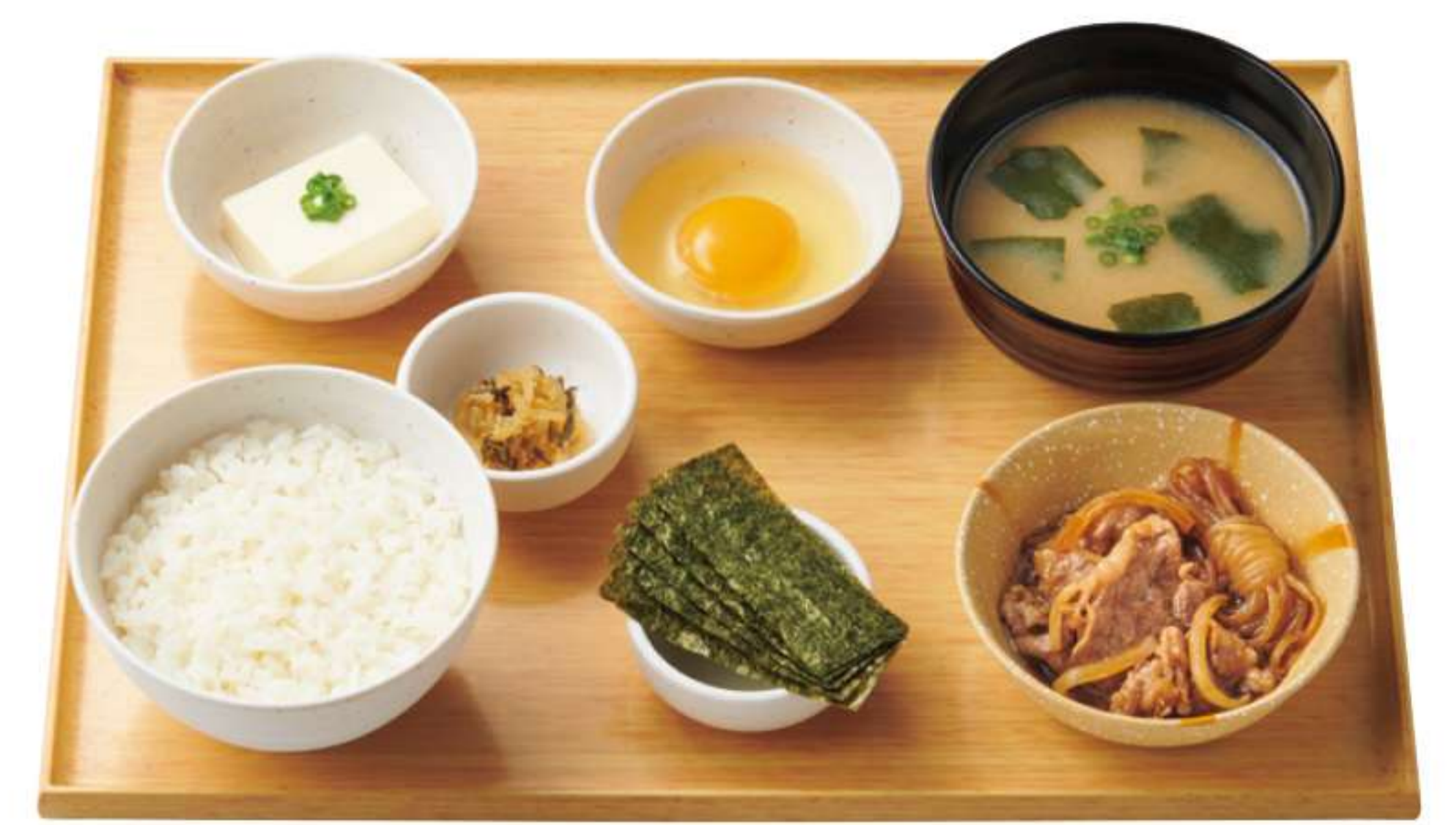
Mini Beef Sukiyaki Breakfast

(Breakfast menu options are served from 5:00-11:00 a.m. at 24-hour restaurants. For other restaurants, please inquire at the restaurant.)