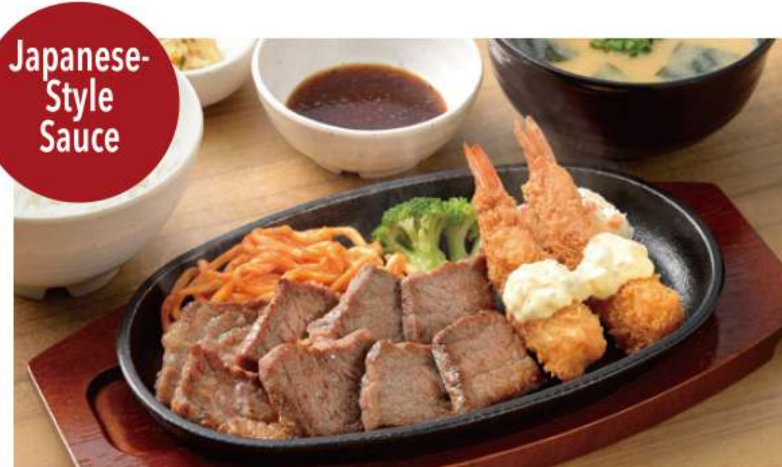
Black Angus Cut Steak and Deep-Fried Prawn Teishoku