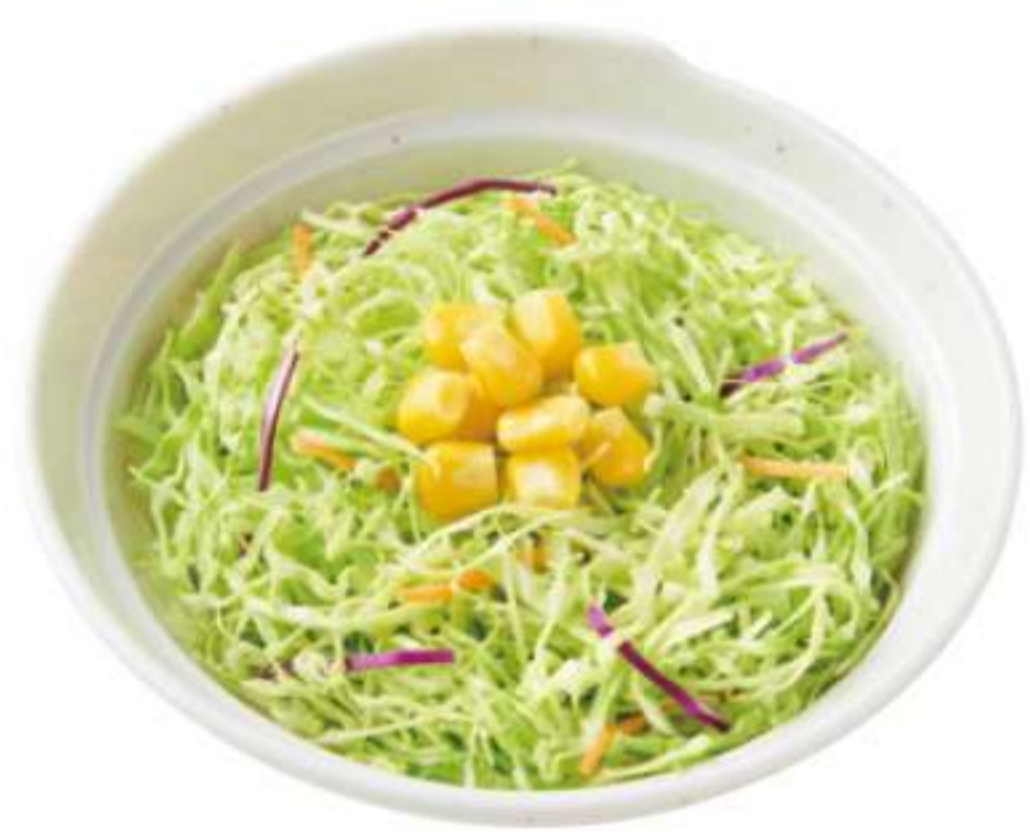
Vegetable Salad ¥ 90