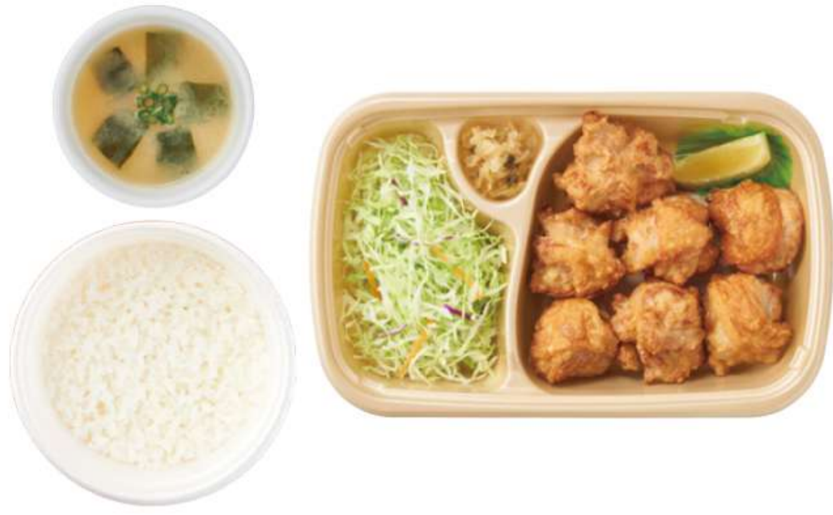
Large Serving Deep-Fried Chicken With rice and miso soup ¥ 960