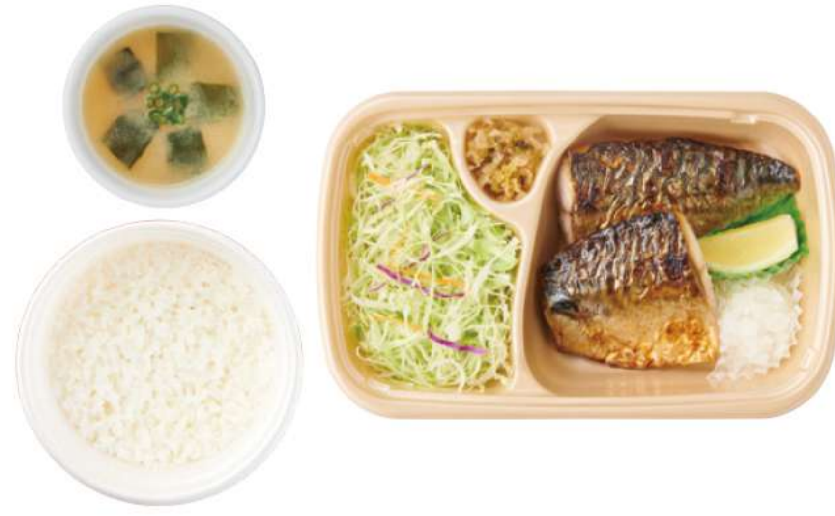
Salt-Grilled Mackerel With rice and miso soup ¥ 770