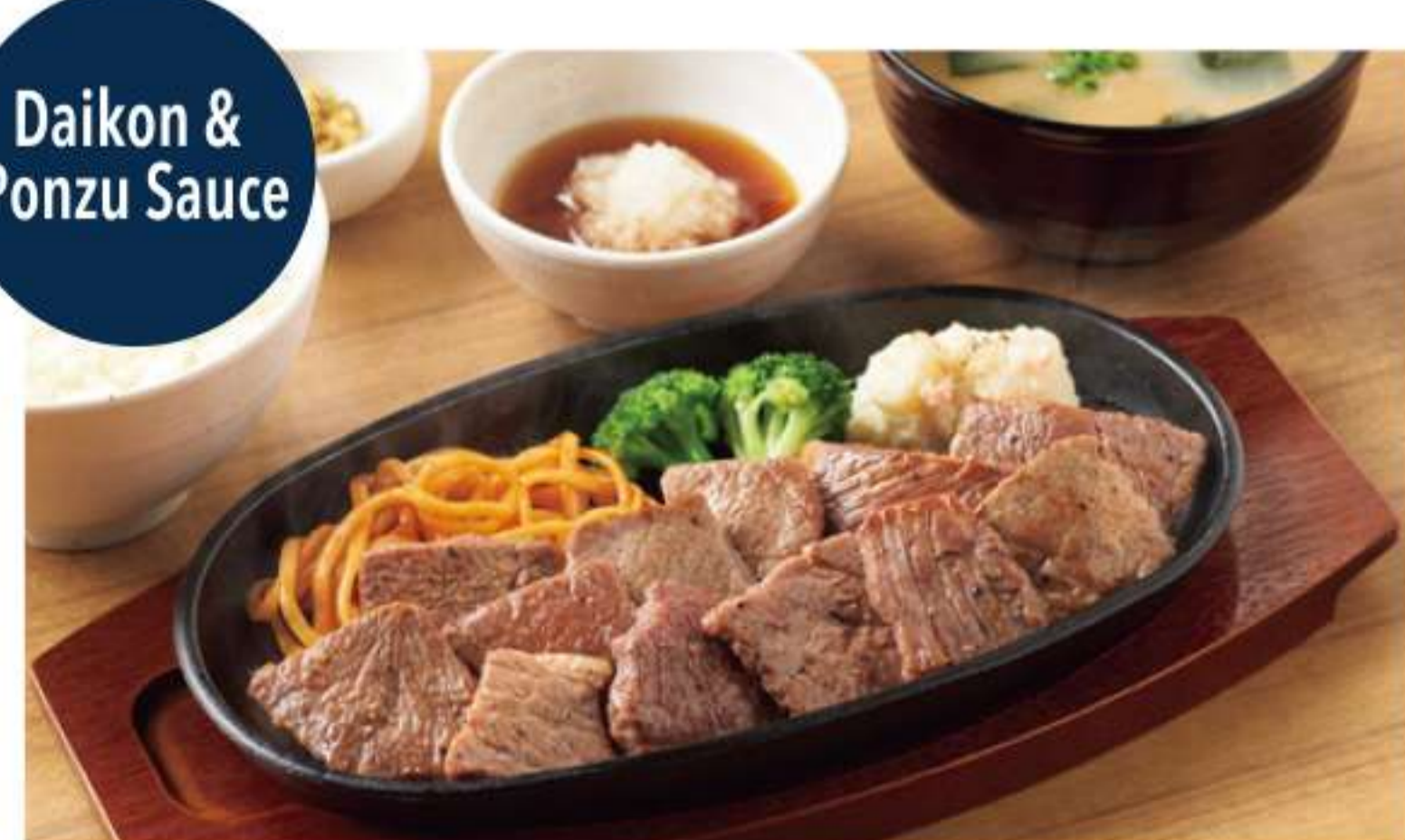
Large Serving Black Angus Cut Steak Teishoku