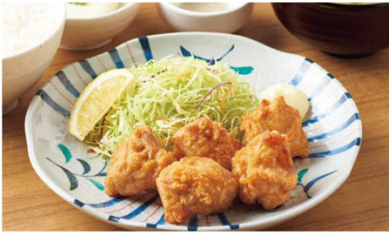
Deep-Fried Chicken Teishoku