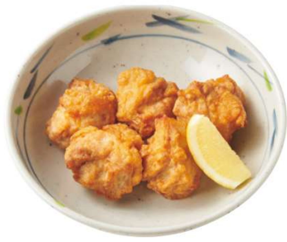
Deep-Fried Chicken (5 pcs.) ¥ 520