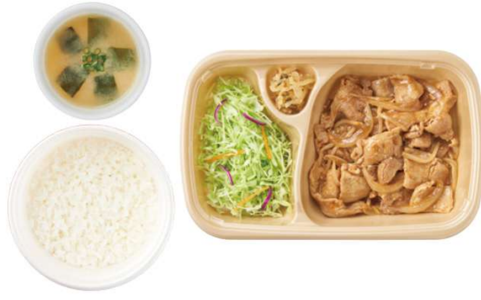
Ginger Pork With rice and miso soup ¥ 730