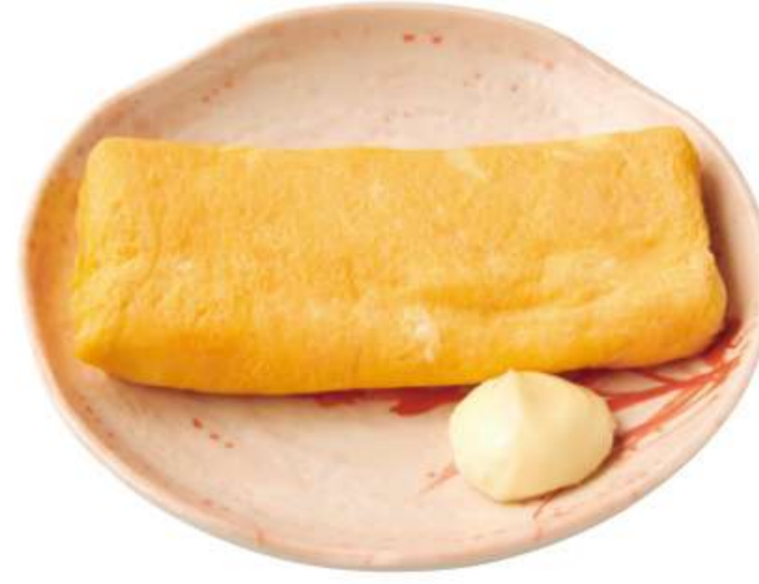
Japanese Omelette ¥ 220