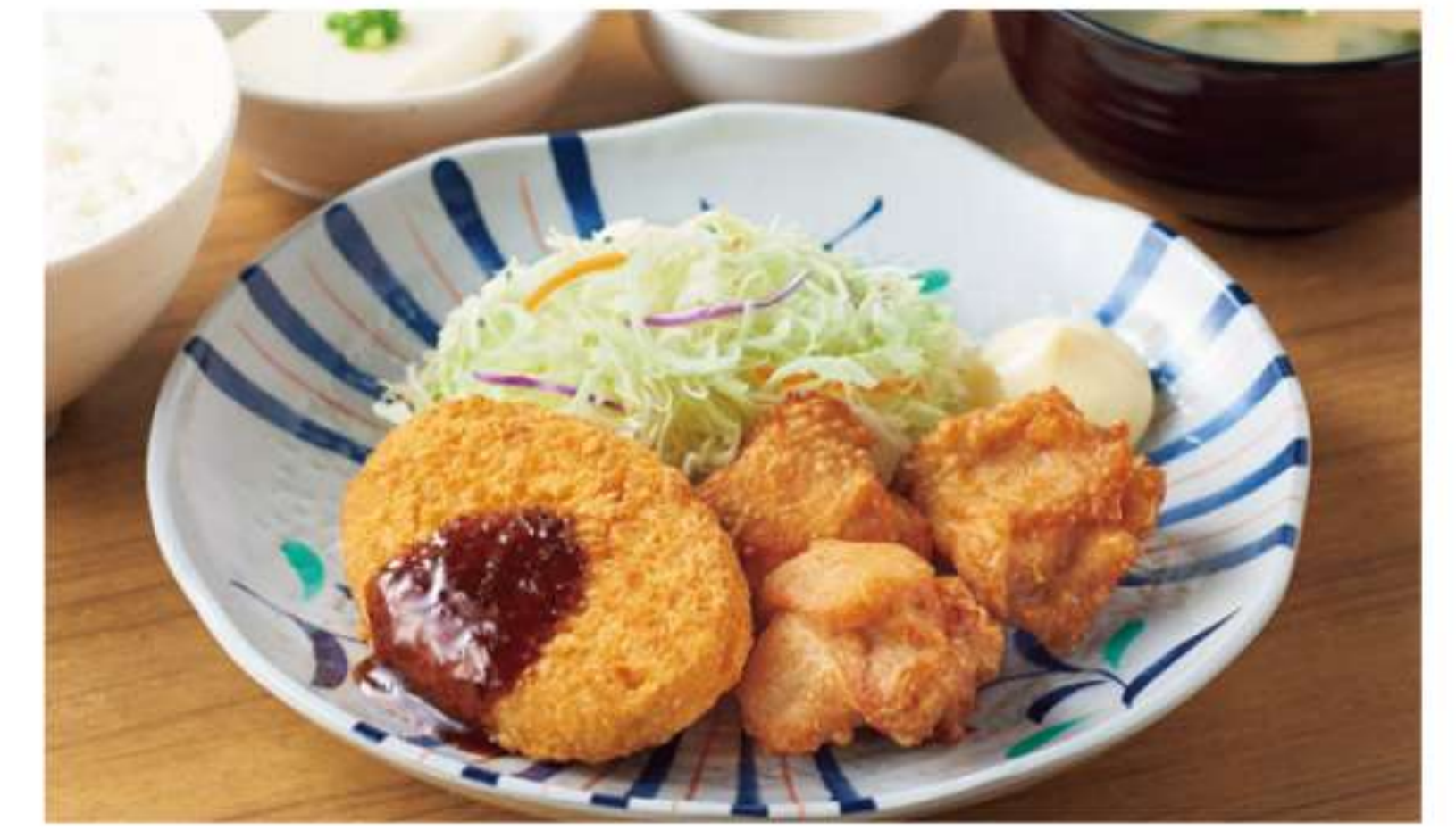
Deep-Fried Chicken & Potato Croquette Teishoku