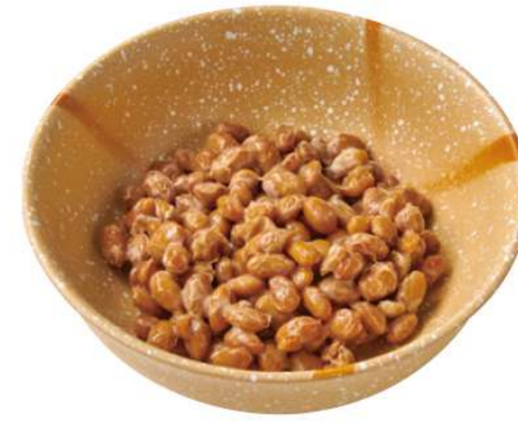
Natto ¥ 100