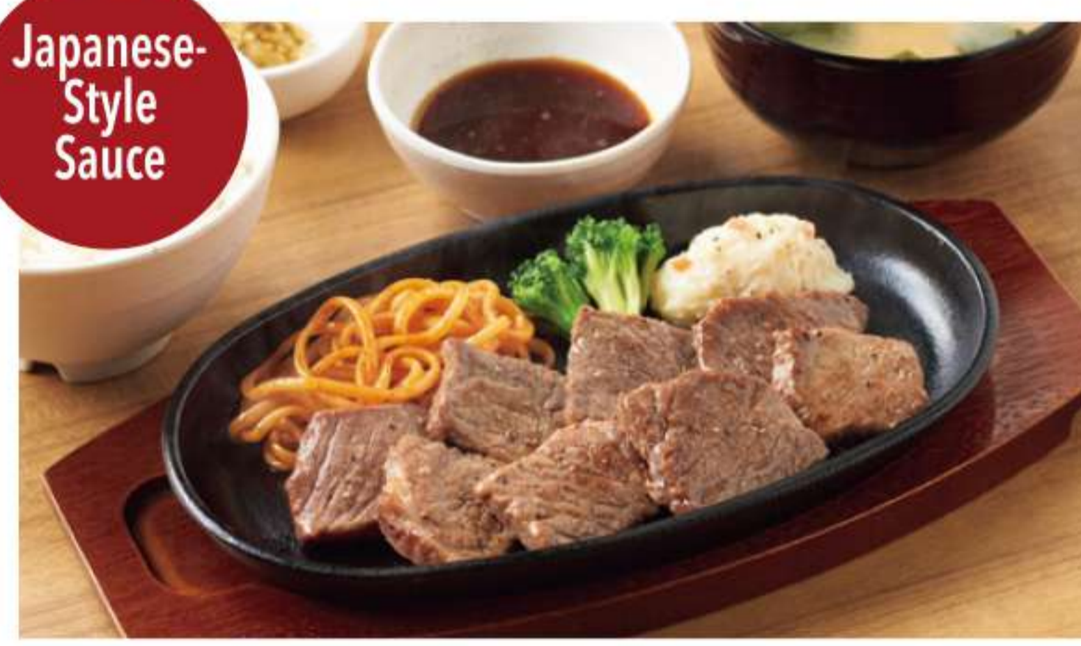
Black Angus Cut Steak Teishoku