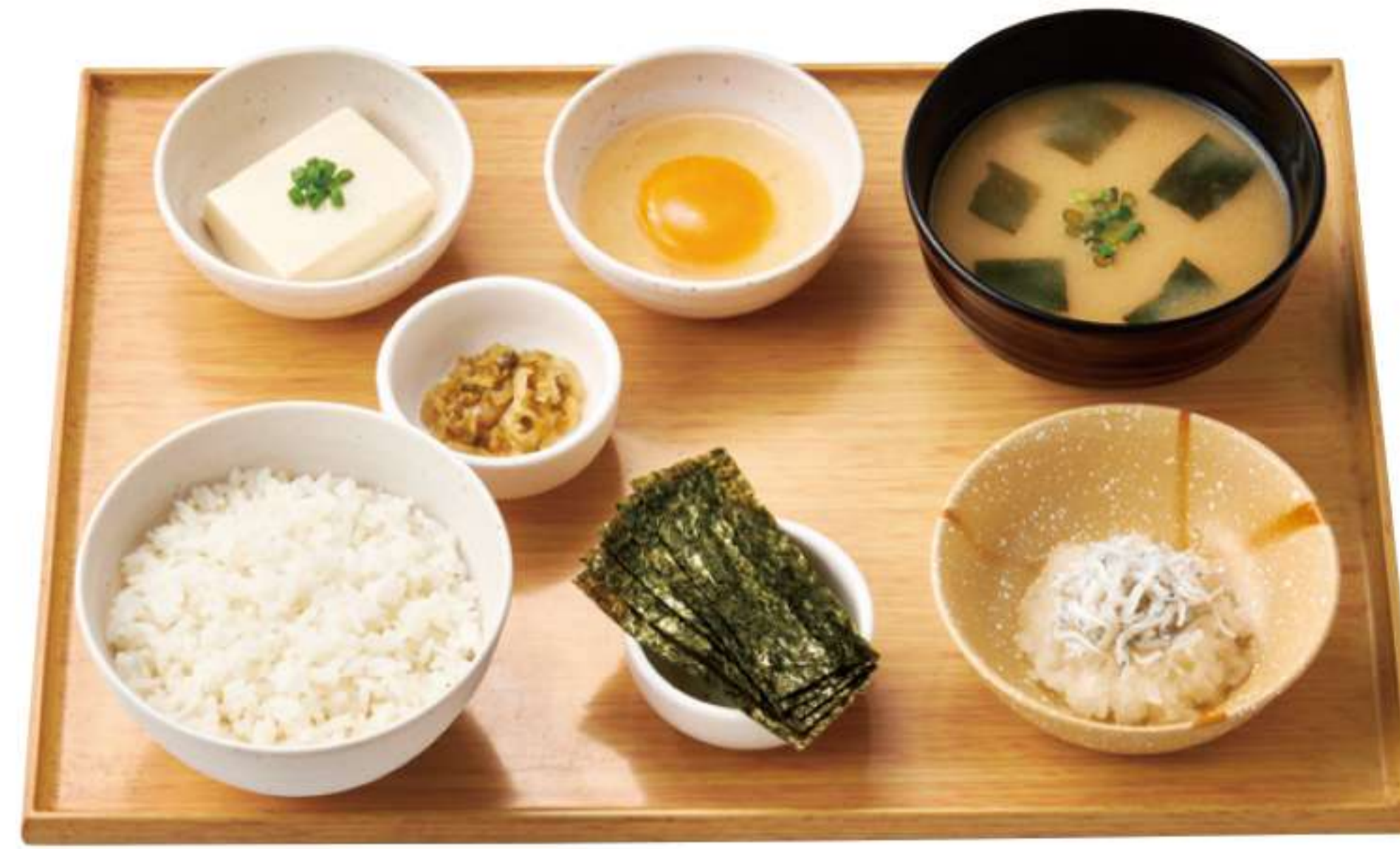
Whitebait and Grated Daikon Breakfast Teishoku

(Breakfast menu options are served from 5:00-11:00 a.m. at 24-hour restaurants. For other restaurants, please inquire at the restaurant.)