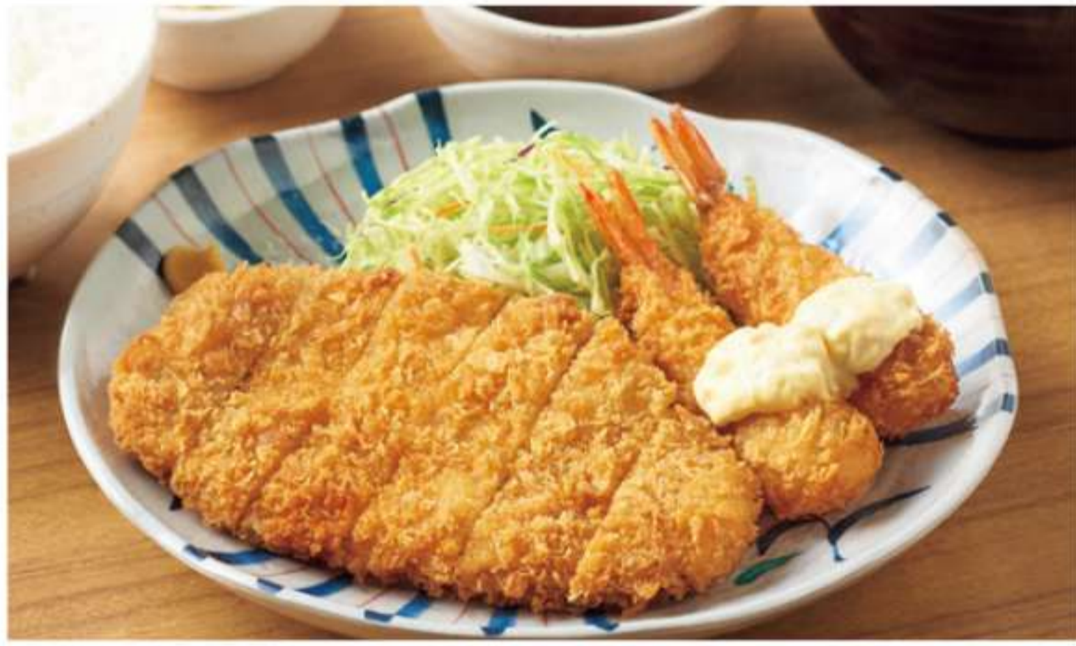
Pork Cutlet and Deep-Fried Prawns Teishoku