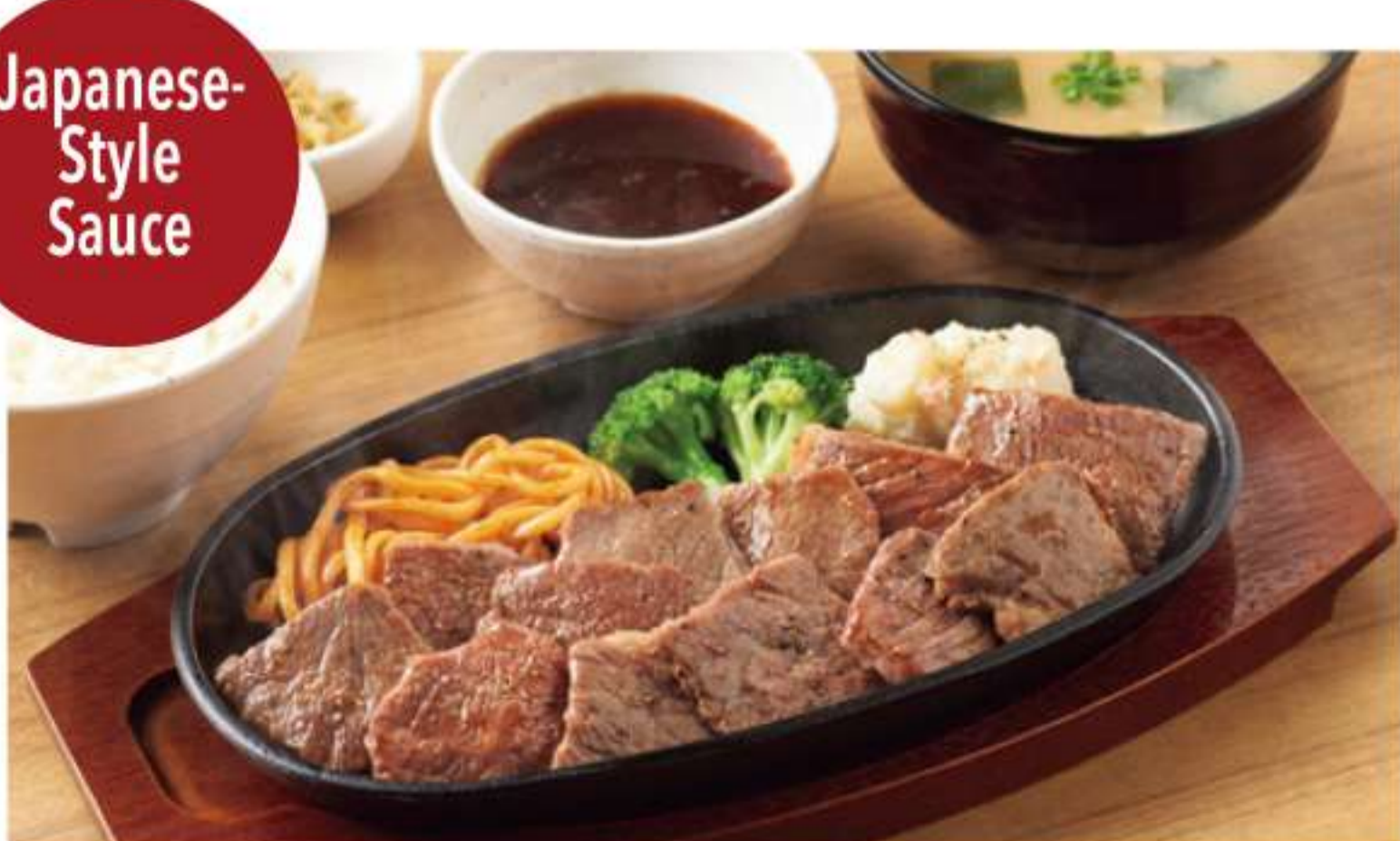
Large Serving Black Angus Cut Steak Teishoku