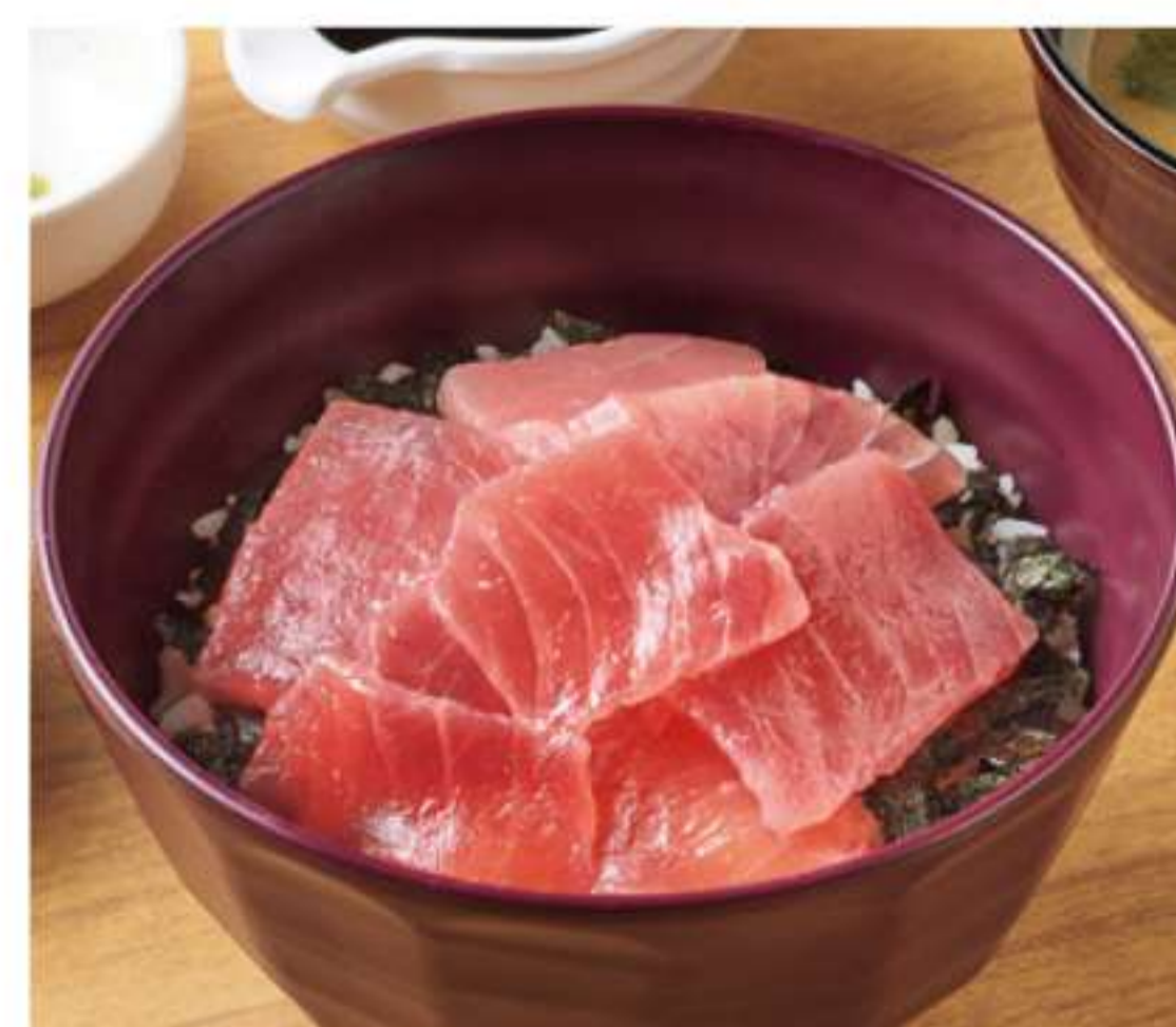
Raw Tuna Slices Rice Bowl (with Miso Soup)