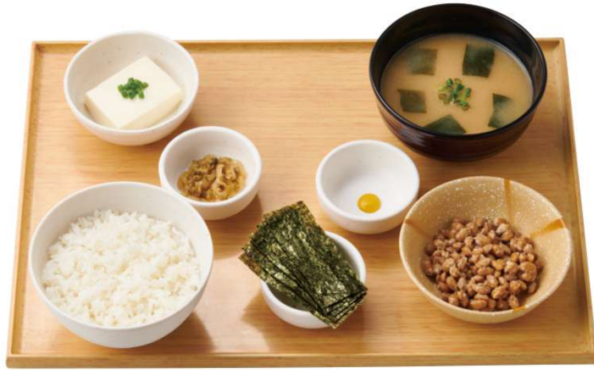
Natto Breakfast Teishoku