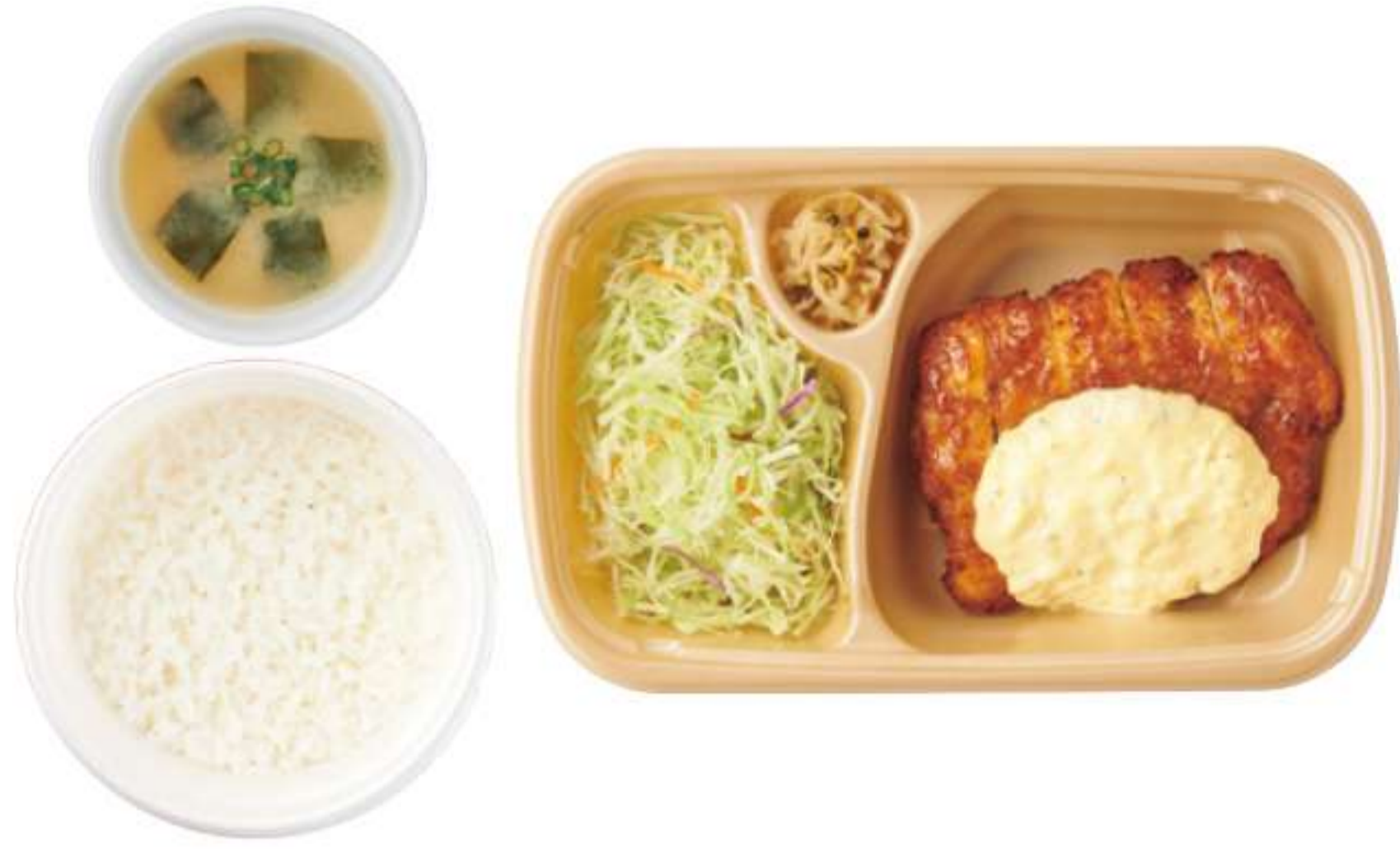
Fried Chicken with Tartar Sauce With rice and miso soup ¥ 910