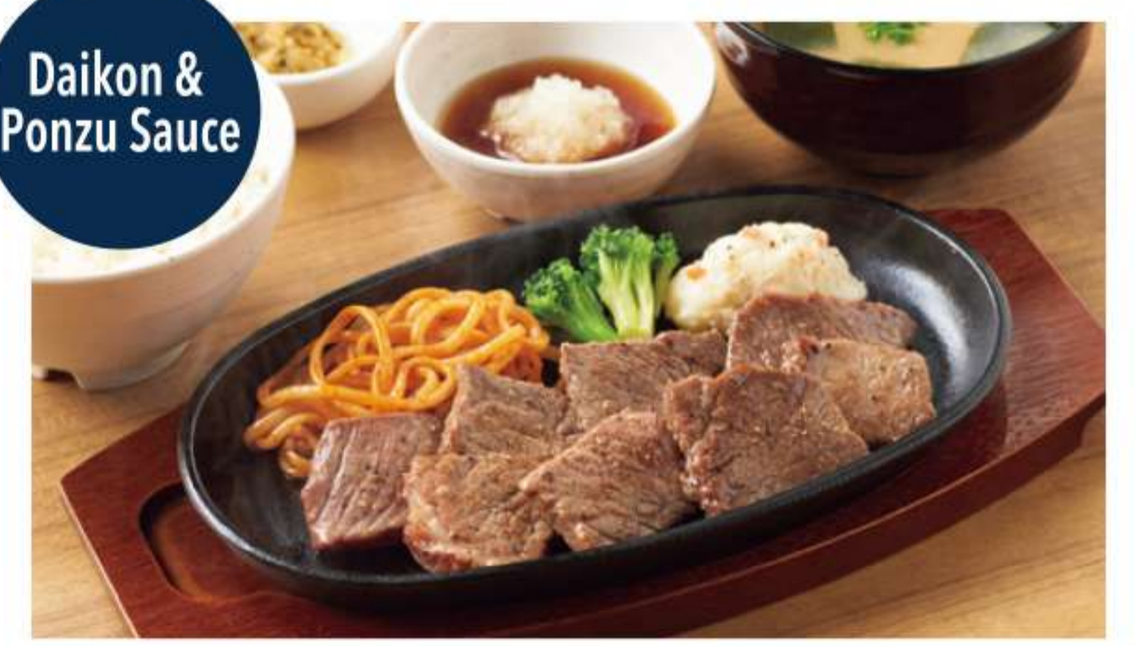
Black Angus Cut Steak Teishoku