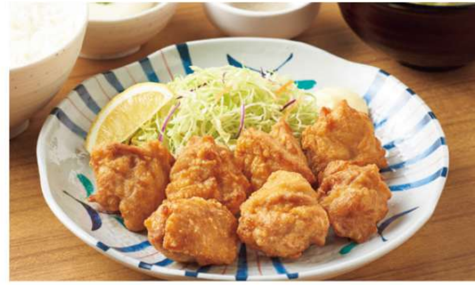
Large Serving Deep-Fried Chicken Teishoku