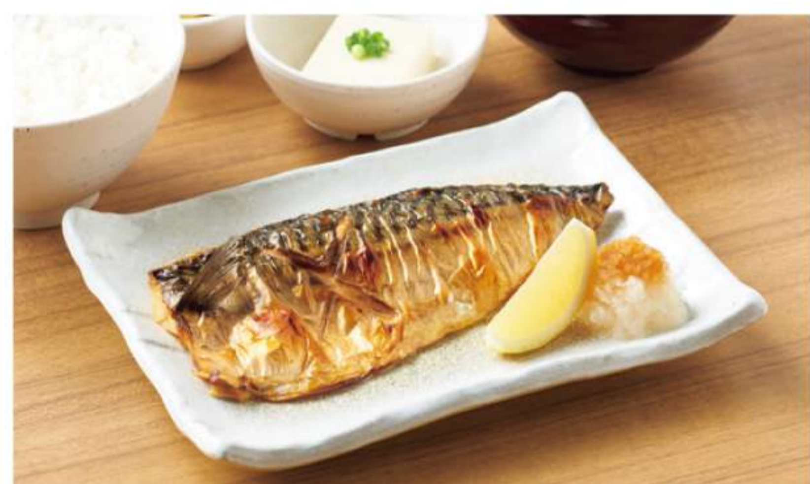
Salt-Grilled Mackerel Teishoku

(Free refills on rice with set meals (excluding rice with pearl barley).)