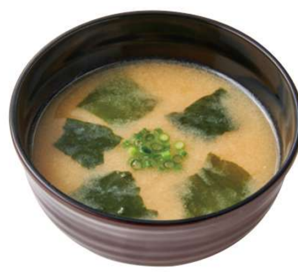
Miso Soup (à la carte) ¥ 100